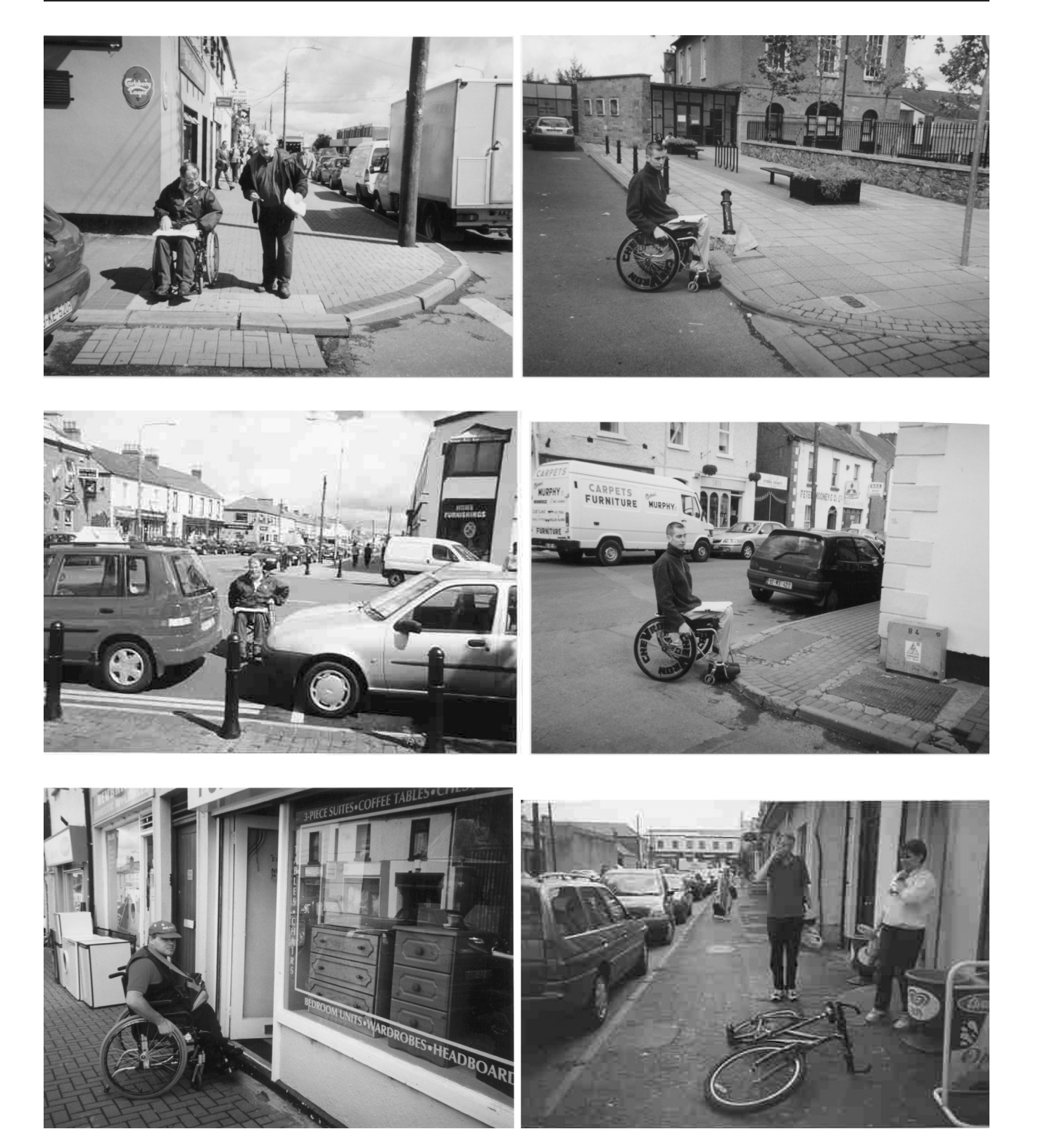
Figure 2. Undertaking the audit and some problems encountered