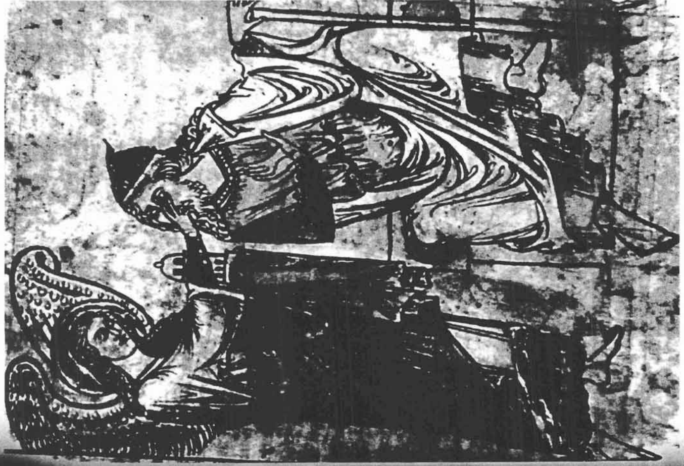
Illustration: The healing of Tobit, 13th c. English manuscript.

The only text in the First Testament to demonstrate a thorough-going acceptance of medical aid is the "poem in praise of the physician" (Sir 38:1-15). In it the wise teacher recommends that his students "make friends" with the physician, and attempts to prove that medical expertise has its origins in God's wise design of creation, which included healing herbs. For Ben Sira, the physician is a partner with God in the work of healing,