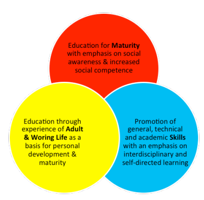
Figure 1: Aims of Transition Year (TYCSS, 2002).