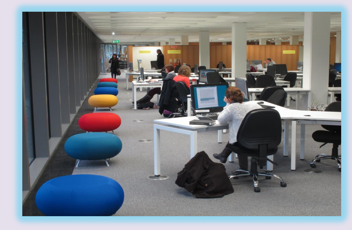
Students studying on ground floor during extended opening hours