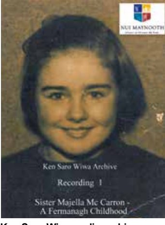
Ken Saro-Wiwa audio archives.