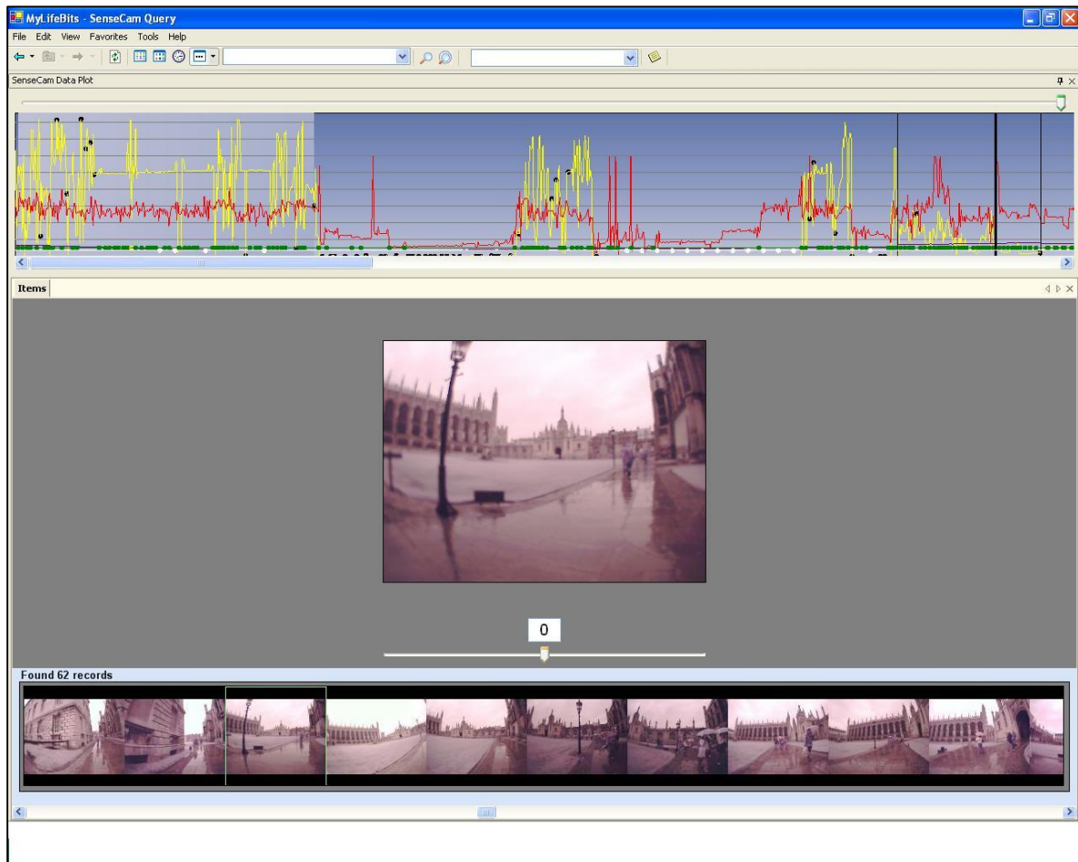
Figure 2: The experimental interface to the photographic log produced by the SenseCam prototype (source: Williams and Wood, 2004).