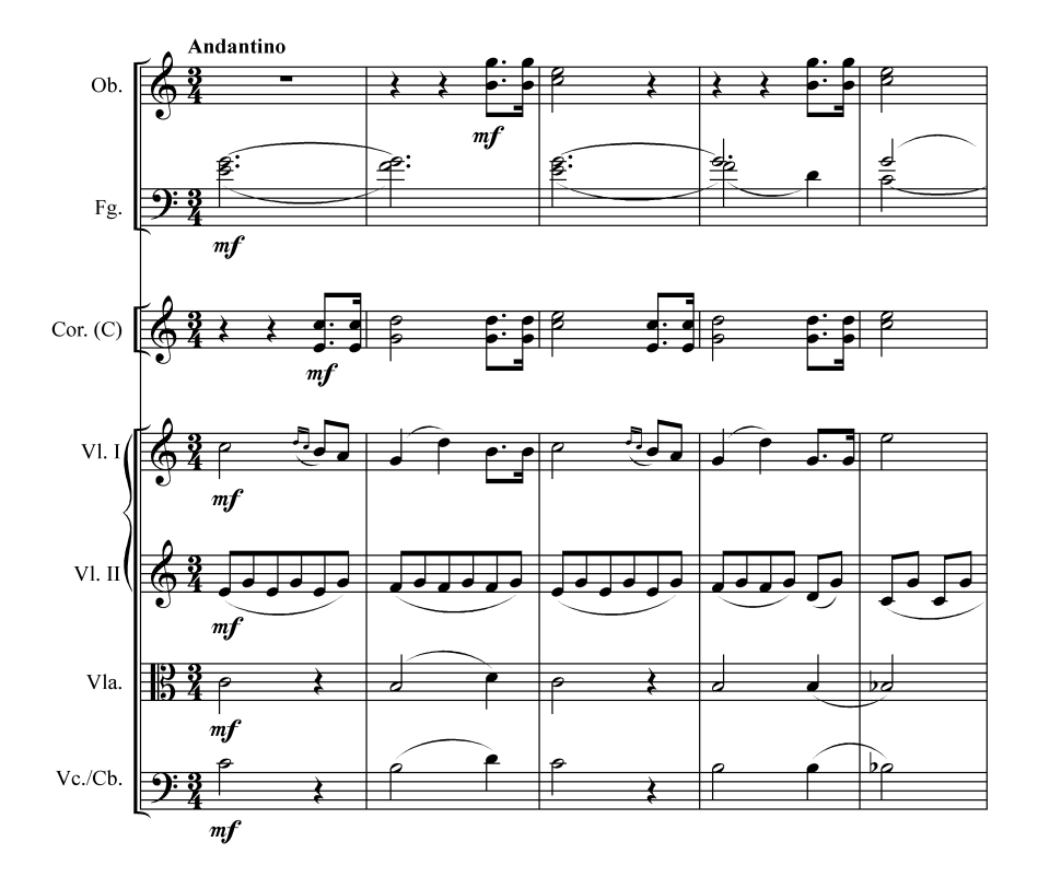
Example 12.11 Franz Schubert, Claudine von Villa Bella (D 239), Aria (No.4) Andantino, bars 1-4

The charming ensemble, 'Fröhlicher, seliger herrlicher Tag', with its graceful solo for the child is a typical Singspiel ensemble setting with alternating choral and solo episodes. Onversely Claudine's aria (no.4), 'Alle Freuden, alle Gaben, die mir heut' gehuldigt haben', is more suggestive of an Italian da capo aria with its high coloratura passages. The contrast in musical styles subtly reflects the dual influences on Goethe's text, and the contrast in orchestration between the solo and choral settings reveals the composer's theatrical sense. The orchestration in Schubert's arias and ariettas is much more subtle than in his ensembles. A good example of this is found in the introduction to Claudine's aria 'Alle Freuden, alle Gaben', where Schubert carefully balances the orchestral forces: the oboes join the answer in the horns and are balanced with quaver strings: