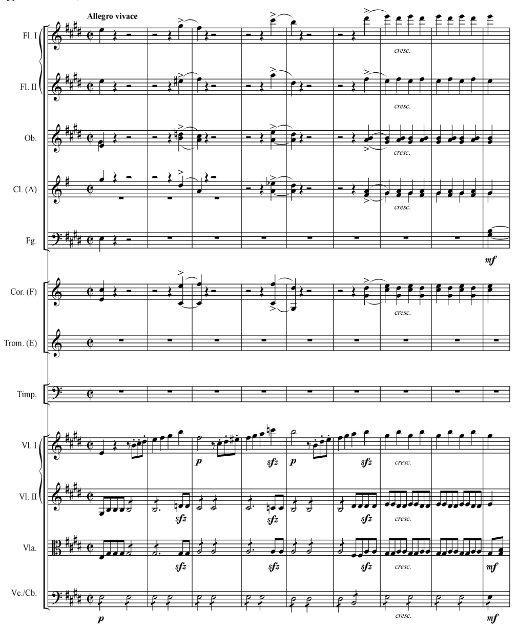
Example 12.4 Franz Schubert, Claudine von Villa Bella (D 239), Overture, Allegro vivace, bars 20-28

In performance, the Allegro vivace creates a real feeling of theatre and forms a very apt introduction to the piece: