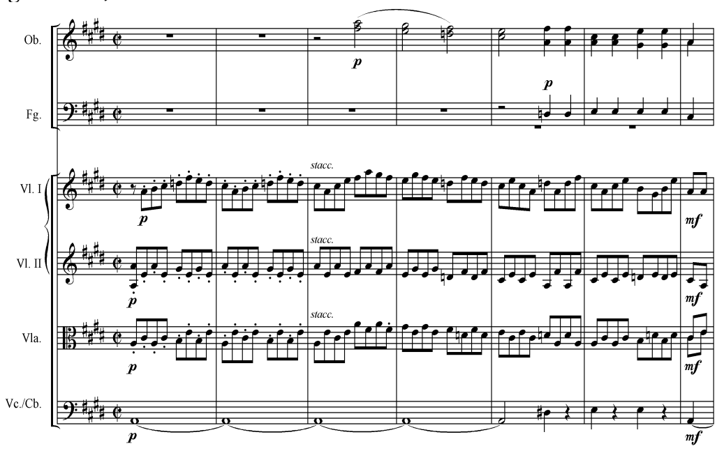
Example 12.6 Franz Schubert, Claudine von Villa Bella (D 239), Overture, Allegro vivace, bars 107-113

And Schubert's use of bass motifs creates a strong sense of drama throughout the score: