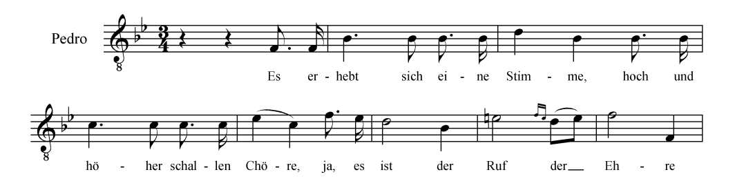
Example 12.14 Franz Schubert, Claudine von Villa Bella (D 239), Aria (No.5) Maestoso, bars 19-29