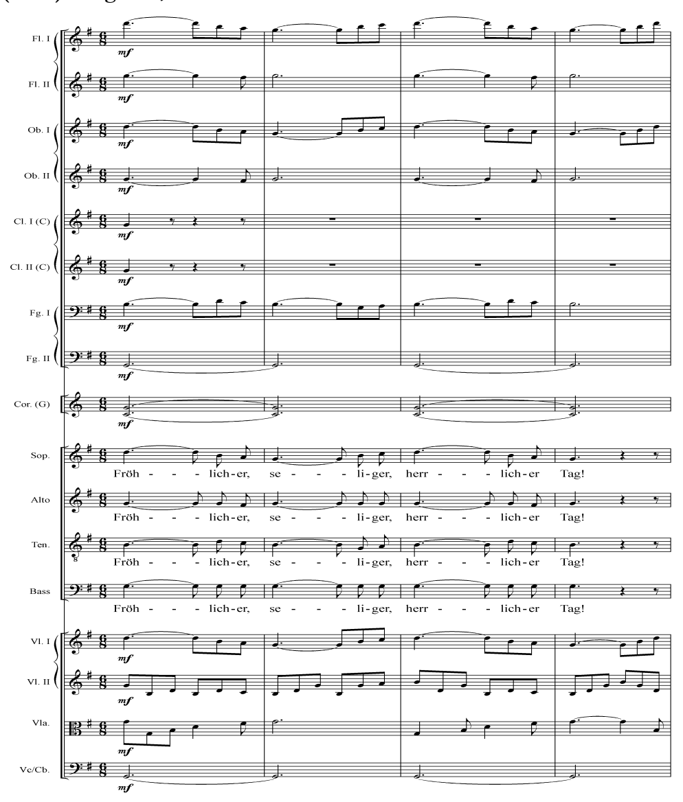
Example 12.12 Franz Schubert, Claudine von Villa Bella (D 239), Ensemble (No.2) Allegretto, bars 13-16

In contrast to this, the orchestration accompanying Schubert's ensembles is written with much broader strokes