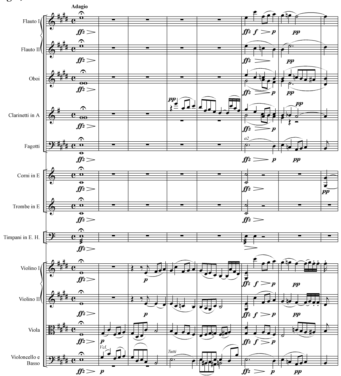
Example 12.3 Franz Schubert, Claudine von Villa Bella (D 239), Overture, Adagio, bars 1-8