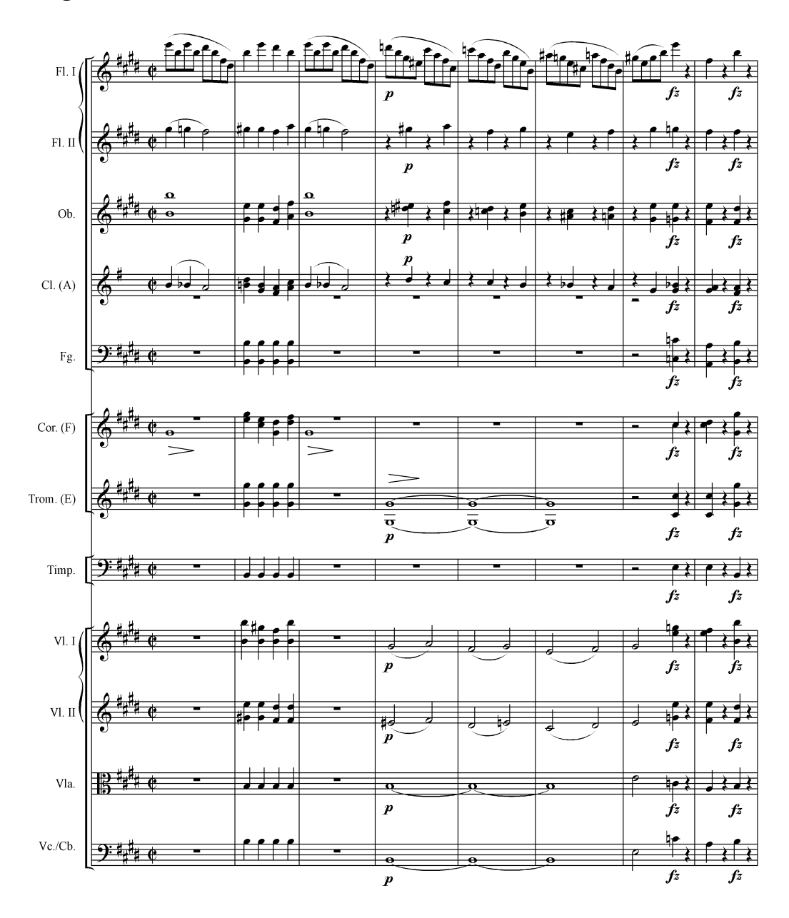
Example 12.5 Franz Schubert, Claudine von Villa Bella (D 239), Overture, Allegro vivace, bars 50-67

Schubert's contrasting textures are very nicely handled: