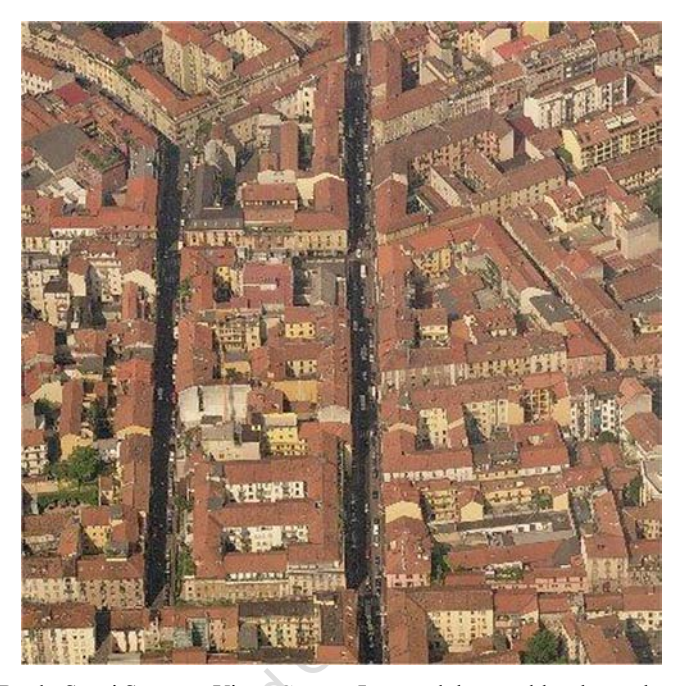
Fig. 5. Paolo Sarpi Street, a View.

result only residents are allowed access and transit, though taxis and motorcycles are exempt from exclusion. So as to enforce such provisions, the local authorities have erected a network of CCTV cameras to monitor traffic. This process of urban transformation was politically interpreted as an attempt to eradicate Chinese wholesalers from the district.