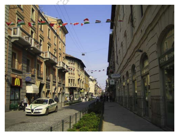
Fig. 8. The Pedestrianization Process in Paolo Sarpi Street, April 2011.

So, retail traders, retail craft I believe being the best vocation for Paolo Sarpi Street. Some residence, the same ones, otherwise ... It needs to go back to what it was during the Borgh di Scigolatt , when retail craft prevailed, and I'm not talking about furniture crafts, I'm talking about craftsmanship. There is a vocation on that street, but the