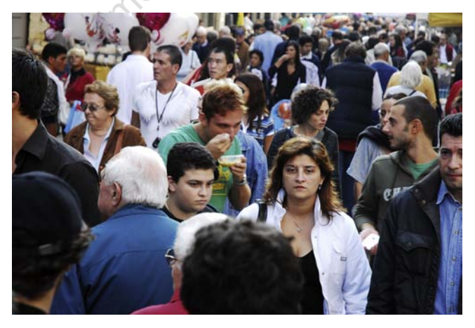
Fig. 1. People on Paolo Sarpi Street.