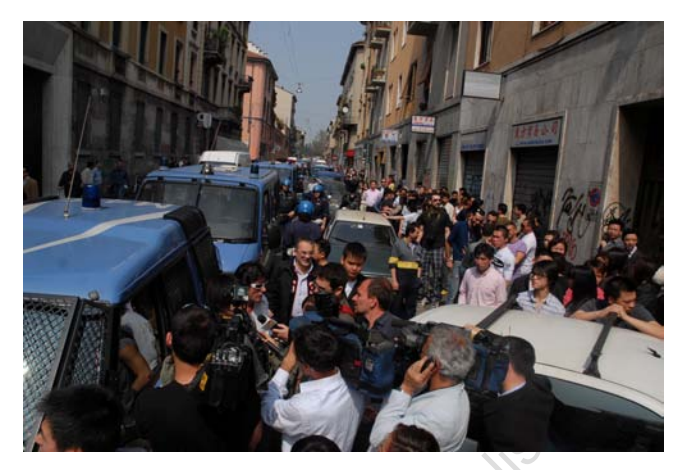
Fig. 9. The Urban Conflict in Paolo Sarpi Street on April 12, 2007.

(physical) and ethnic (cultural) differences in their local practices have produced an even greater change in the 'appearance' of some of Italy's well-known urban landscapes. (Krase, 2007, p. 102)