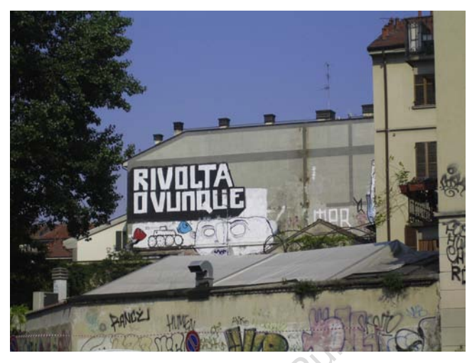
Fig. 7. Protest Murals on Sarpi Wall: Look at the Claim "Rivolta Ovunque" (Riot Everywhere), at the Hand Without the Thumb, and at the Chinese With a Work Cart, April 2011.