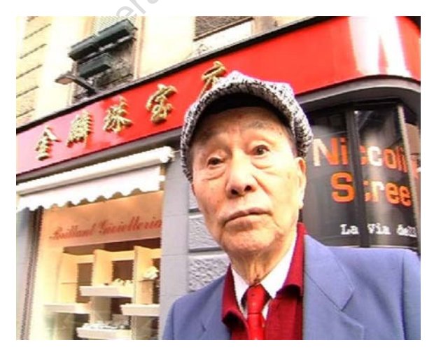
Fig. 2. One of the First Chinese Pioneers in Milan.

Many of these immigrants were industrial workers, and their educational levels were also pretty low ... so abroad they did the usual kind of jobs for migrants ... just the typical ones. For example, street vendors ... surely the Milanese remember the ties sellers along the sidewalks ... they also sold cheap jewelry and gift items. Among other things there are curious pictures of these characters that you can compare with, for instance, old photos of Italian immigrants. There is an equally significant photo of a Venetian man who emigrated to London and who was a grinder, and he was shown doing his job in the middle of the road at a kiosk where he would sharpen blades ... this was around 1924–1925. Meanwhile in Italy the immigrants were Chinese vendors of ties ... All in all, emigration is still the same, it doesn't matter if you look from one side or the other. (J.L.)