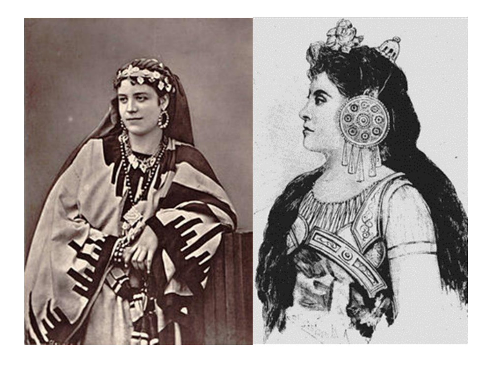
Figure 2.2a: Rosine Bloch as Azucena (1874) and a drawing of Deschamps-Jéhin as Dalila from Le Voleur illustré (1892)<sup>386</sup>

It is obvious she is an artist of value; her voice is penetrating, marvellously coloured; but, in spite of these qualities, I believe that Madame Deschamps-Jéhin has not achieved the equal of her predecessor. ( La Revue Diplomatique )<sup>387</sup>