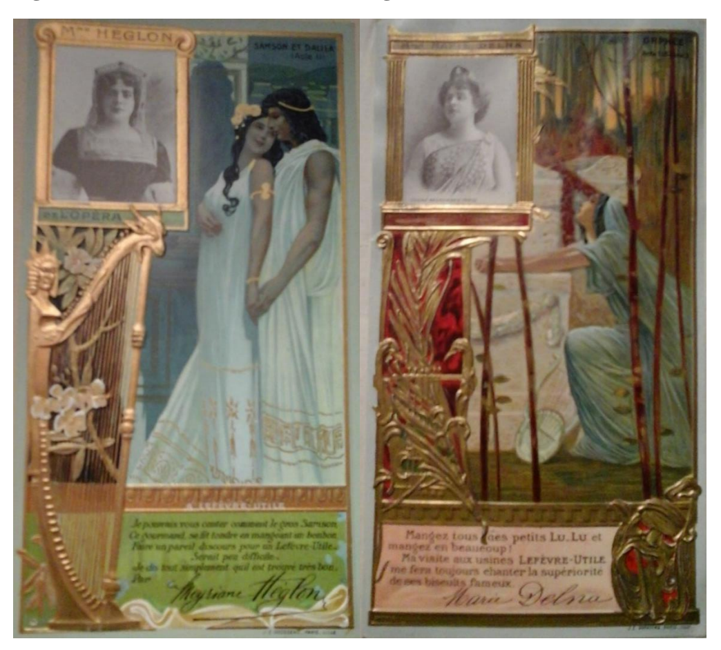
Figure 1.2d: Lefèvre-Utile cards for Héglon and Delna<sup>227</sup>

Using gold-leaf decorated cards, the Lefèvre-Utile advertising campaign (which circulated around 1905) was a widespread one featuring a host of famous singers, actors, authors, composers and politicians, and included luminaries such as Sarah Bernhardt and Anatole France amongst its ranks. Héglon's card was based on Samson et Dalila , and featured a drawing from Act Two of the opera, below which was printed this limerick: