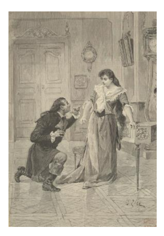
Figure 2.3c: Drawing of Act Three duet between Delna and Ibos (1893)<sup>519</sup>

This restrained nature was present at a musical level as well, as her darker vocal tone combined with a controlled, relatively modest vocal line throughout most of the opera made her into a clear maternal figure rather than a romantic one.<sup>520</sup> The only time that Charlotte shows any signs of more dramatic musical behaviour is when she is around Werther, or can no longer hide her feelings for him — for example, she reaches an a-sharp'' in the Ossian scene of Act Three on the line 'Defendez-moi Seigneur contre lui' (Lord protect me from him).<sup>521</sup> This conflict between her rational maternal nature and her attraction to Werther eventually leads to the neglect of her parental responsibilities, with most of her duties appearing to pass to Sophie as she leaves the house on Christmas Eve. Musically and dramatically, this is strongly emphasised by the change in the sister who leads the children's Christmas carols — Charlotte is introduced in Act One with a