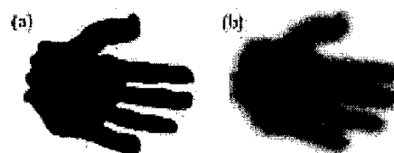
Figure 2: Drawn image of a hand (a) before and (b) after convolution with a Gaussian filter

A system to improve the structural detail obtained uses an optical filter as illustrated in figure 3. Using this system, radiation scattered by edges in the target is preferentially detected, while the main on-axis illuminating beam is blocked by the central obstruction of the spatial filter. This will use a detector array or the scanning system being developed in the new Biomedical Imaging Laboratory at NUI Maynooth.