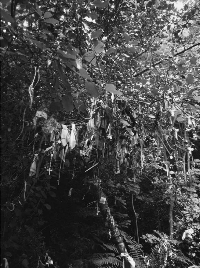
Figure 5. Rag tree ritual: Tobernalt.

from Tobernalt Holy Well (Figure 5). Indeed one can see from the image that older, curative traditions and forms such as the rag, have been augmented by a very contemporary form of practice with a whole new range of objects, still arguably embodied, emerging at well sites. Other healing rituals, repeated at many pilgrimage sites with ascribed curative powers, included the leaving behind