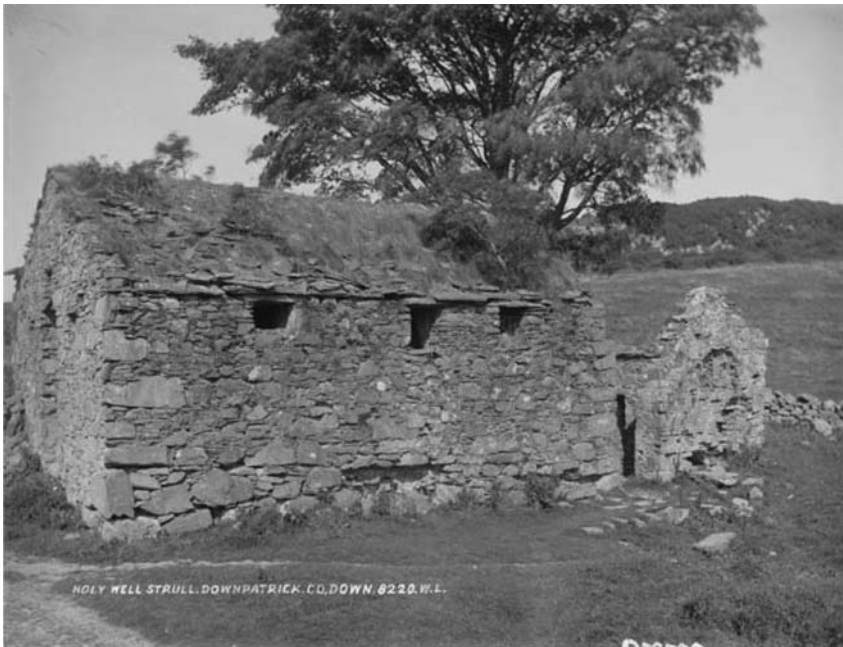
Figure 7. Struell holy wells: Men's and women's bath-houses (photo: National Library of Ireland).

Given the unusual presence at a well of two medieval bath houses side by side, male on the left and female on the right (Figure 7) and the co-presence of alcohol and nakedness, it was little wonder that such 'unhealthy practices' emerged as they did. Over time, however, there was a clampdown on such contested pilgrimage practices. The church, which had always maintained a fairly ambivalent position on well worship, banned patterns because of their immorality and lack of religiosity, while the colonial powers were also concerned about public order in relation to the drink and in particular, the faction fighting (Ó'Cadhla 2002). Things are much tamer nowadays but the old practices and the narratives sustain in many places and music and dancing is still held around St. Brigid's Wells at Kildare and Liscannor. In employing Conradson's (2007) reframing of therapeutic benefit as a contested and relational outcome, then the unhealthy and unholy performances at the well simultaneously reflect this. This also reflects wider pilgrimage discourses where the sacred and profane were never far apart (Turner and Turner 1978).