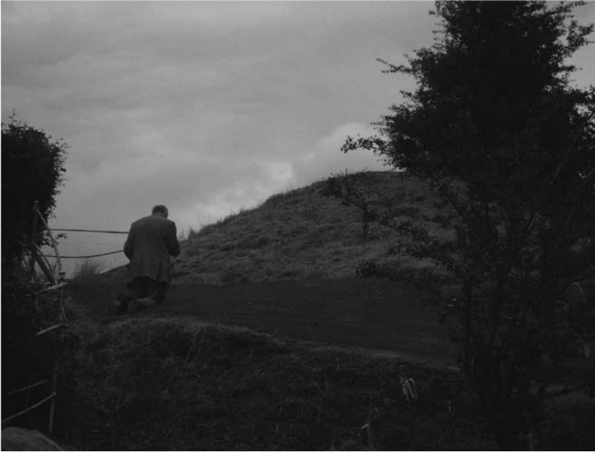
Figure 6. Retreat at St. Kieran's Well.