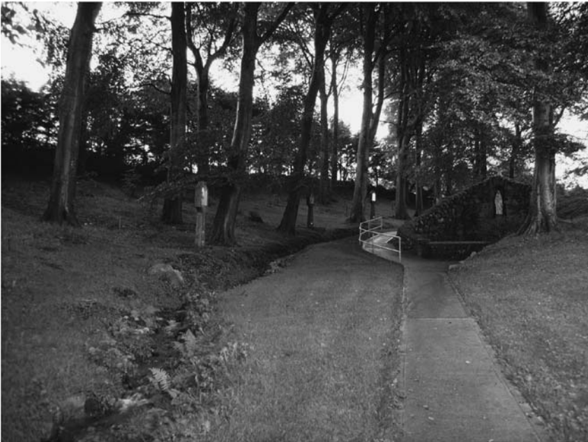
Figure 2. Faghart: St. Brigid's shrine.

As pilgrimage settings are invariably spaces of change and movement (of people, objects and meanings), new uses and identities, associated with groups of difference such as neo-pagans and Travellers emerge. These are in turn shaped by independently developed contemporary cultural practices so that they have increasingly become spaces of memory and mourning as well. Ironically for sites that are of their essence, organic, grounded and free, holy wells have been subject to a surprising number of contestations shaped by a series of ‘gazes’ including the religious, colonial and medical where they have at different times been suppressed, overwritten and dismissed (Hardy 1836; Ó’Cadhla 2002). As sites of pilgrimage they are naturally liminal spaces with a liminality that is part framed by narratives and texts that bring them into contact with the exercise of power by church and