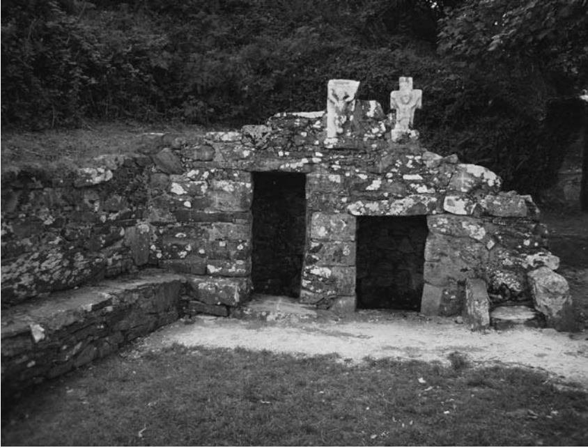
Figure 1. Contemporary image of St. Declan's Well Ardmore.

from high church to low public. How geographical settings (place) and healing rituals (practice) intersect at holy well sites to produce therapeutic landscapes is at the heart of this paper.