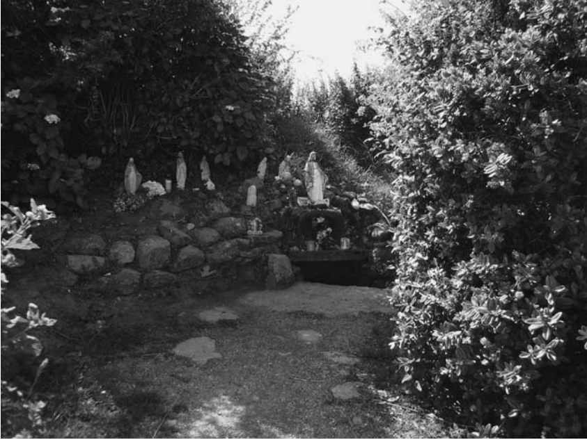
Figure 3. Holy well: Our lady's island (photo: author's own).

state authorities. As Eade and Sallnow (1991) suggest, these texts may also act as a tool for the contestation of that power. Figure 4 identifies the location of the estimated 3000 Irish wells, and the marked wells are representative examples studied in detail for this paper.