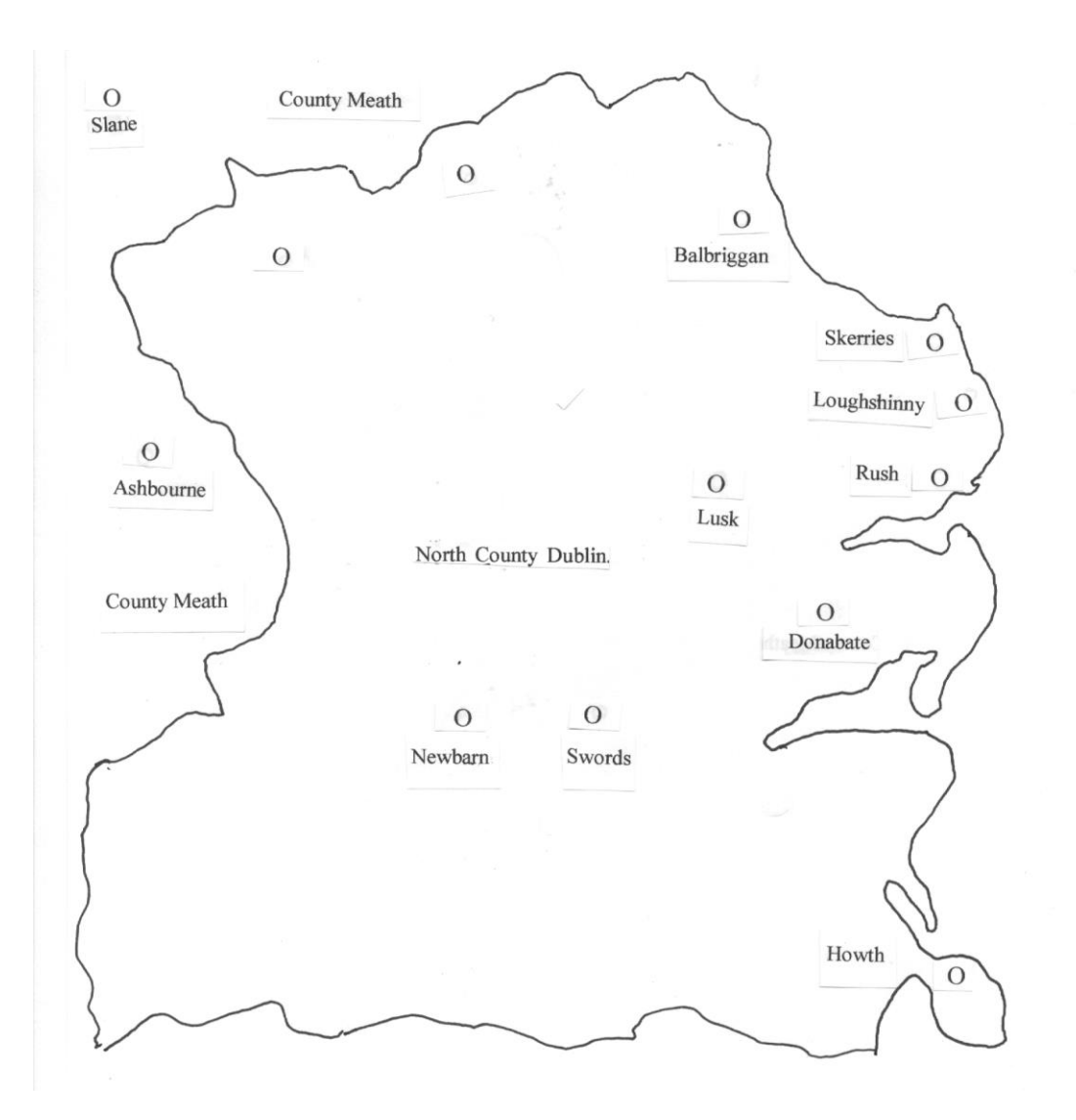
Plate 2: North county Dublin and Ashbourne, county Meath. The two places marked on the map but inadvertently left without names were Naul and Garristown.