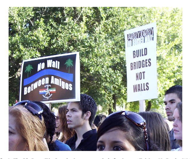
Fig. 1. The Río Bravo/Rio Grande river as a symbol of unity not division: No Border Wall protest, Texas, 2008.

Wall building also proceeds by waiving the law. In meetings with U.S. Department of Homeland Security (USDHS) Secretary Michael Chertoff in early 2007, Texas leaders were told they would be consulted if and when any fencing was planned for the Texas