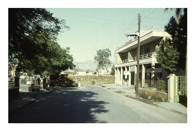
Fig. 6. Barricade in the "no man's land": Nicosia, Cyprus, 1964.

The H4C concentrates symbolic meanings of co-operation by putting infrastructures of peace into practice. The geographical and historical context of the H4C – a historical multi-communal, multi-functional area where commercial and residential life was tightly interwoven, located in a buffer zone of intractable conflict. where separate communities now meet in a safe space – physically embodies a viable "third space" and may offer a model for other divided societies. Claiming a part of Nicosia considered as "dead" and transforming it into a forum of contact and unconstrained, decentered dialogue between all communities means to question those normalization narratives implicit to nationalist histories, as well as claims tied to states of exception and division in Cyprus (Makriyianni & Psaltis, 2007). It means to acknowledge the needs and fears of all communities, and to interrogate dominant narratives of victimization through research. Intergroup contact is instrumental in overcoming conflict as it facilitates the decrease of realistic and symbolic threats, anxiety, and negative stereotypes for the other community (Allport, 1954; Tausch et al., 2010). In the case of the H4C, it is also a unique means of achieving academic excellence in teaching history. Although the H4C does not have ability to completely overcome systemic states of exception or division, it does offer citizens a safe space to imagine a different Cyprus through transformative knowledge.