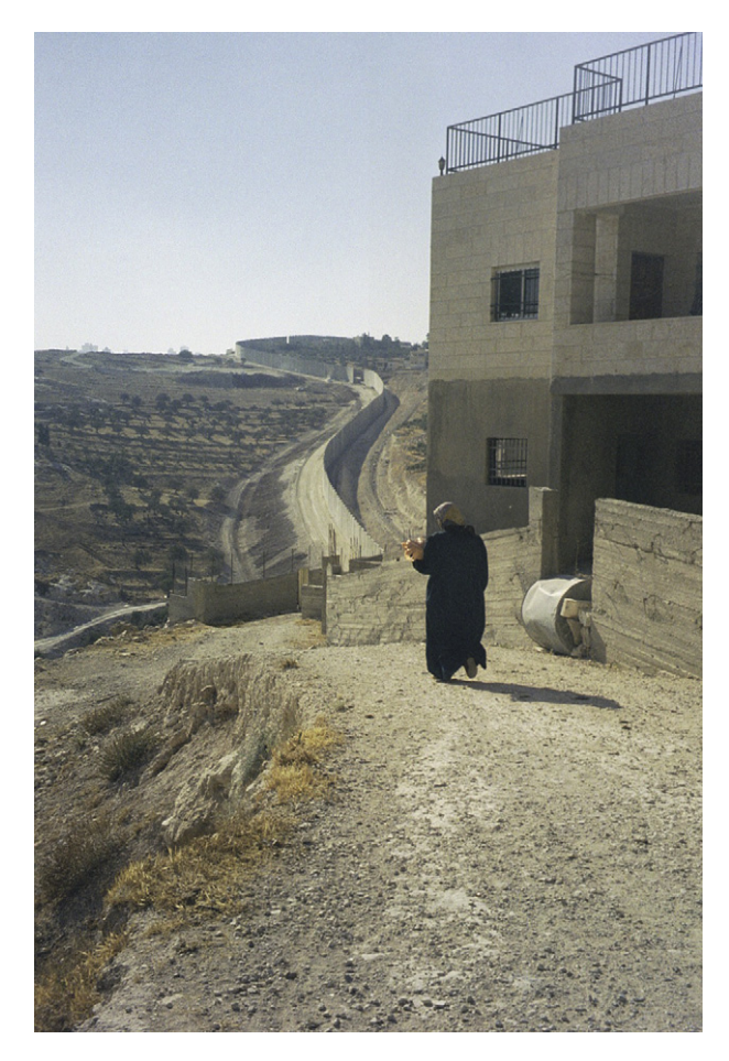
Fig. 3. The separation barrier at Jerusalem's Abu Dis neighborhood, 2008: the political aesthetics of a contested landscape.

Israel continues to claim that the barrier is for security; the Palestinians have regarded it as a land grab. In the years since its inception, the structure is more clearly part of a larger program to dismantle Palestinian East Jerusalem, encourage emigration and generally restrict Palestine as a state (Dolphin, 2006; Dumper & Pullan, 2010, pp. 1–16). A conflict infrastructure has been developed and maintained that includes Israeli civilian settlements and