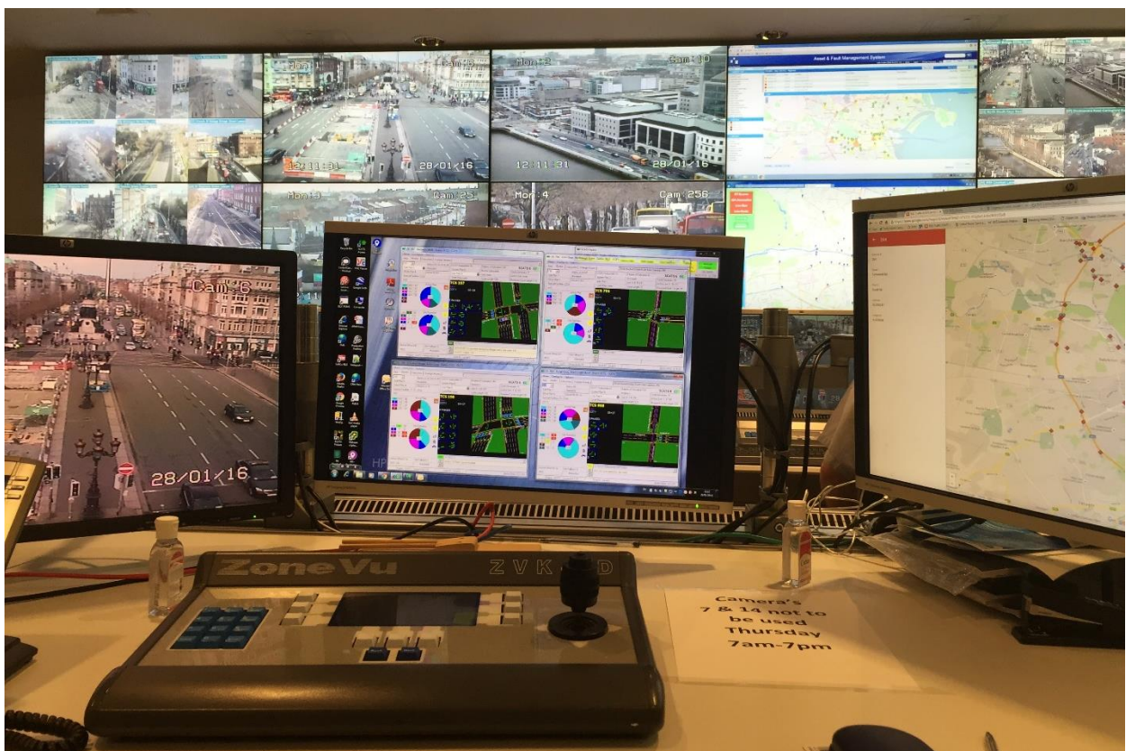
Figure 2: A view from a controller's desk in the Dublin traffic control room

The core means by which the data are parsed and used to control traffic flow is via the adaptive traffic management system, SCATS (Sydney Coordinated Adaptive Traffic System). SCATS is an automated and adaptive system whose primary role is to manage the dynamic timing of signal cycles and phases at junctions for vehicles, cycles and pedestrians in order to ensure the optimal flow, minimize congestion and accidents, and manage incidents. The system is adaptive in the sense that it automatically calibrates the cycles and phases dependent on a set of programmed rules and the flow, speed, and density of traffic for each lane of traffic in previous cycles and phases. For example, the number of cars and the gaps