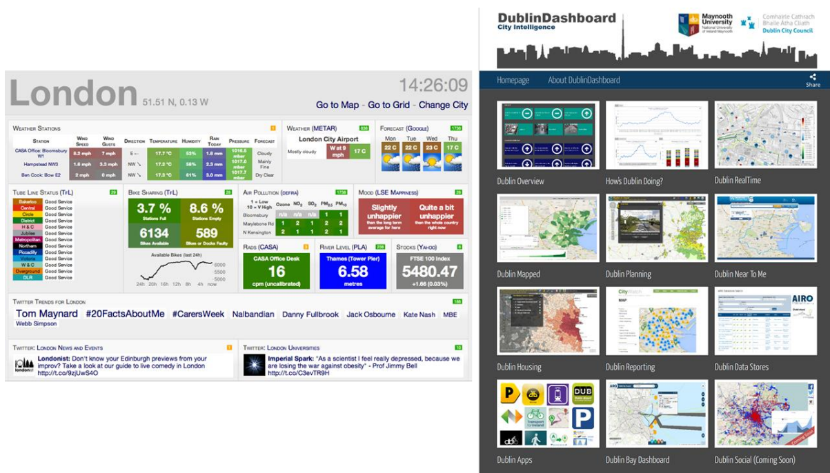
Figure 1: An at-a-glance and analytical city dashboard

Typically, city dashboards display seven kinds of data: