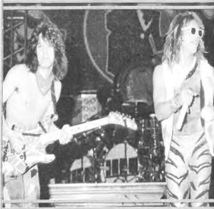
Figure 3. Van Halen wearing spandex 18

notions of masculinity within the music of the performers as they took on new shapes, often employing spikes or the shapes of weapons. This is quite fitting as the electric guitar is also known as an 'Axe'; 17 this further associates the electric guitar with the role of the warrior. BC Rich, Ibanez, Jackson, and ESP were the main manufacturers of these new guitars (see fig.4).