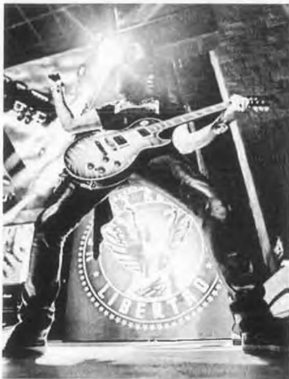
Figure 1. Slash from Guns 'n' Roses, power stance 12

York: Routledge, 1990), pp. 371–89 (p. 372). Hereafter referred to as Frith and McRobbie, 'Rock and Sexuality'.