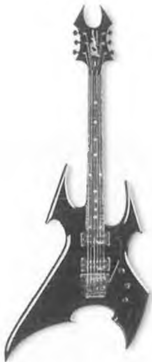
Figure 4. BC Rich Beast guitar 19

The shape of the guitar was not the only thing that changed in these new designs: technologically the guitars were modified to allow for louder volumes and greater levels of distortion. These modifications included the development of the active pickup, a new electronic component on the electric guitar. This device uses a separate power supply and a built-in preamp to eliminate noise generated by electricity passing through the pickup. In his article 'California Noise: Tinkering with Hardcore and Heavy Metal in Southern California' Steve Waksman states that 'Tinkering with the electric guitar has been a predominantly masculine endeavour, the end of which could be deemed the fortification of manhood as much as the specific technological or musical goals that are