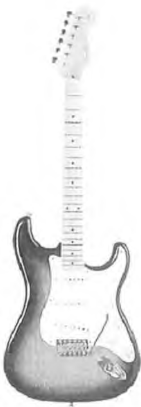
Figure 5. Fender Stratocaster, note bridge vibrato system and attached vibrato arm 35

metal guitarist to attack the guitar with the vibrato arm and produce screams and moans from the guitar, which has obvious sexual connotations similar to that of the romantic virtuoso violinist 'disciplining' the string. This is evident in listening to the following: Steve Vai, Alien Love Secrets , 'Bad Horsie'. 34