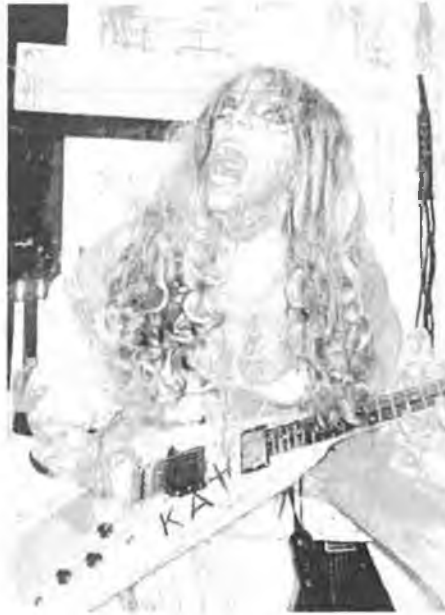
Figure 7. 'The Great Kat', Bloody Vivaldi 39

Even in this article negative language regarding Thomas' inclusion in the top ten is present, albeit in good humour. Nevertheless the negative connotations regarding Thomas' gender are there.