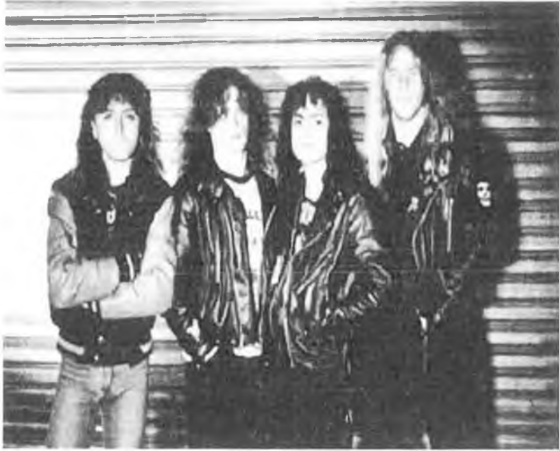
Figure 2. Metallica leather clad 15

Other guitarists in this genre wore spandex: 'Pants made of this material allow greater freedom of movement on stage and better display the athletic bodies of the performers, thereby promoting an image of vital power'. 16 This type of costume was popular amongst bands like Van Halen (see fig. 3).