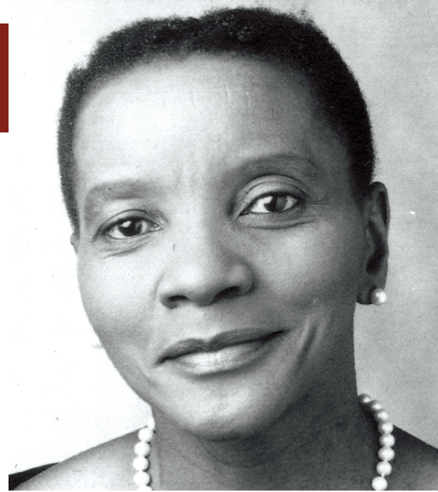
Sindiwe Magona was born in the Transkei (a former South African homeland) in 1943 and grew up in Cape Town's black townships.

Coloured with the language and customs of her people, the novel recounts events from Mandisa’s childhood to the day of the tragedy and captures the world in which women like Mandisa and her children had to grow up during the turbulent years of apartheid.