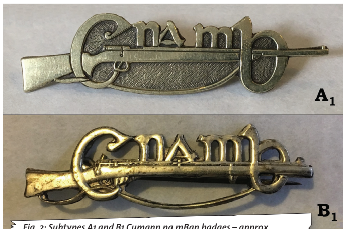
Fig. 2: Subtypes A1 and B1 Cumann na mBan badges – approx. 5.4cm in length.