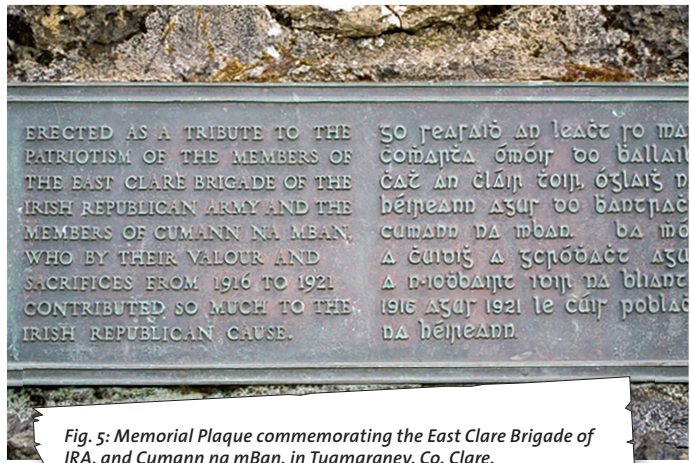
Fig. 5: Memorial Plaque commemorating the East Clare Brigade of IRA, and Cumann na mBan, in Tuamgraney, Co. Clare.

In conclusion, the historical value of CnamB regalia can be ascertained through the combined application of archaeological techniques and documentary research to create a dialogue between an object and its historical context. Before the CnamB Executive set the standard, early CnamB uniforms were of a homemade composite style comprising varying articles, fabrics and shades leading Kitty O'Doherty to remark that some looked 'as if they were cut out with a knife and fork'. At the outset of the War of Independence, CnamB uniforms were abandoned in favour of plain civilian clothes for ease of movement through military and police cordons.