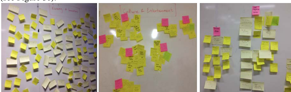
Figure 3. The KJ Method; from the left: Figure 3a, 3b, and 3c.

extracted 164 different instances. For each of them a description, the benefits (where available), and the reference were provided. Hence, one of the members of the focus group started to carefully read each of the initiatives/services. Meanwhile, all the others were responsible for writing their ideas, thoughts, and interpretations about those initiatives/services, highlighting the elementary digital component/capability of each of them. This activity was conducted through small post-its, and each of the members had to make the idea clear in not more than one sentence. All of the post-its were put on whiteboards under the column of the domain of pertinence. The process (“reading”, “writing”, “putting randomly on the whiteboard”) was re-iterated for every domain (see Figure 3a). Once all the post-its were on the whiteboard, we started the grouping stage. First of all we checked the interpretation of the notes, and then we conducted the so called “sniff test”, aiming at grouping the notes in relation to their affinity to each other. In order to facilitate the next step, we also labeled in first approximation each of these groups (see pink post-its in Figure 3b). Finally, as suggested by the KJ Method, we created groups of groups, and where possible also a hierarchical diagram was provided (see Figure 3c).