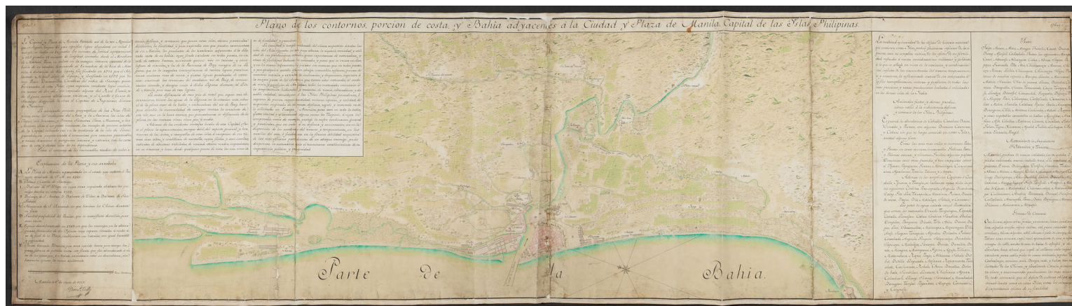
Figure 4. Dionisio Kelly, Plano de los contornos, porcion de costa, y Bahía adyacentes a la Ciudad y Plaza de Manila, Capital de las Yslas Philipinas . Manuscript map on paper roll, 1775. © British Library Board, Manuscripts Add. 17,641.