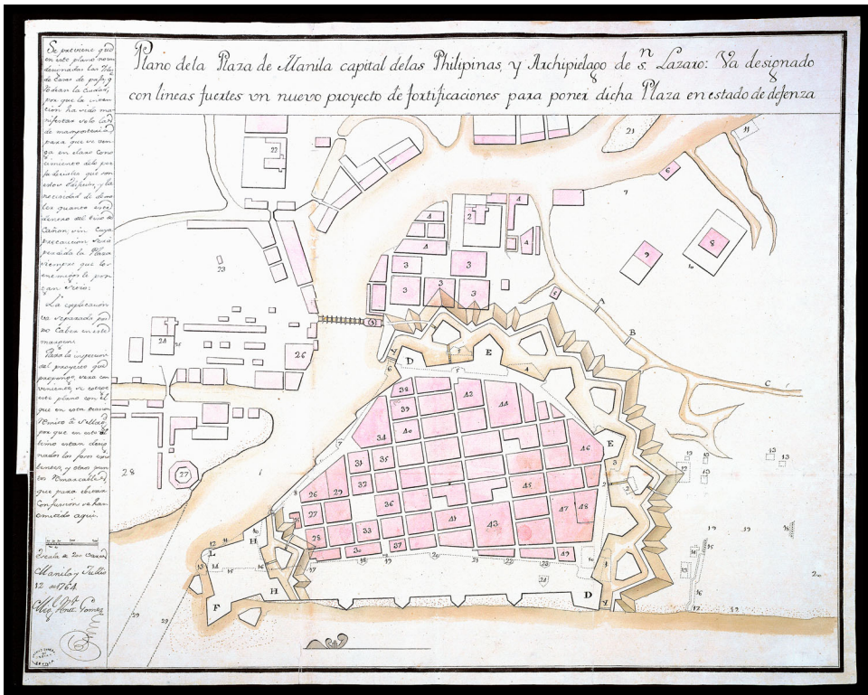
Figure 3. Miguel Antonio Gómez, Plano de la Plaza de Manila capital de las Philipinas, y Archipiélago de Sn. Lázaro: Va designado con líneas fuertes un nuevo proyecto de fortificaciones para poner dicha Plaza en estado de defenza , 1764. Spain. Ministerio de Educación, Cultura y Deporte. Archivo General de Indias, MP-Filipinas,160.

buildings in the Parián (which was home to a substantial Dominican complex as well as the homes, businesses, and cemetery of its Chinese community); much of the part of the Pueblo de Dilao located inside the Estero de San Lázaro; most of the Pueblo de Bagumbayan (including ‘the burnt Church and Convent of San Juan de Bagumbayan, belonging to the Recollect Fathers, whose sacristy the British occupied after demolition’); and the city’s two circum-mural routes: the waterway of the Archipelago de San Lázaro and the Calzada. Moreover, in his accompanying report, Gómez advocated architectural destruction well beyond the removal even of the overwritten structures: ‘It might be [...] convenient,’ he wrote, ‘for your Majesty to demolish the Churches, and the neighbourhoods that ring the Plaza, and that are located within range of Cannon shot.’ 28