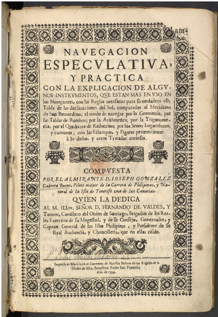
Figure 1. D. Joseph González Cabrera Bueno, Navegacion especulativa y practica , 1734. © British Library Board, 8805.g.2.

appeared in the lavishly illustrated, and generally highly detailed account of Anson's trans-pacific expedition, Richard Walter's 1748 Voyage round the World , had done little more than gesture towards the general shape of the city. And when British mariners had sailed to Manila from India in 1762, they had not drawn upon British charts to make their approach. Rather, they seem to have relied on a single Spanish image: 'Murillo [Velarde]'s chart of the Philippines' (his 1734 Carta hydrographica y chorographica de las Yslas Filipinas ). Indeed, Parker insisted that this map had been taken by Anson himself from the Covadonga, and that Anson had 'sent [it] out by the Argo' for use in 1762. 15