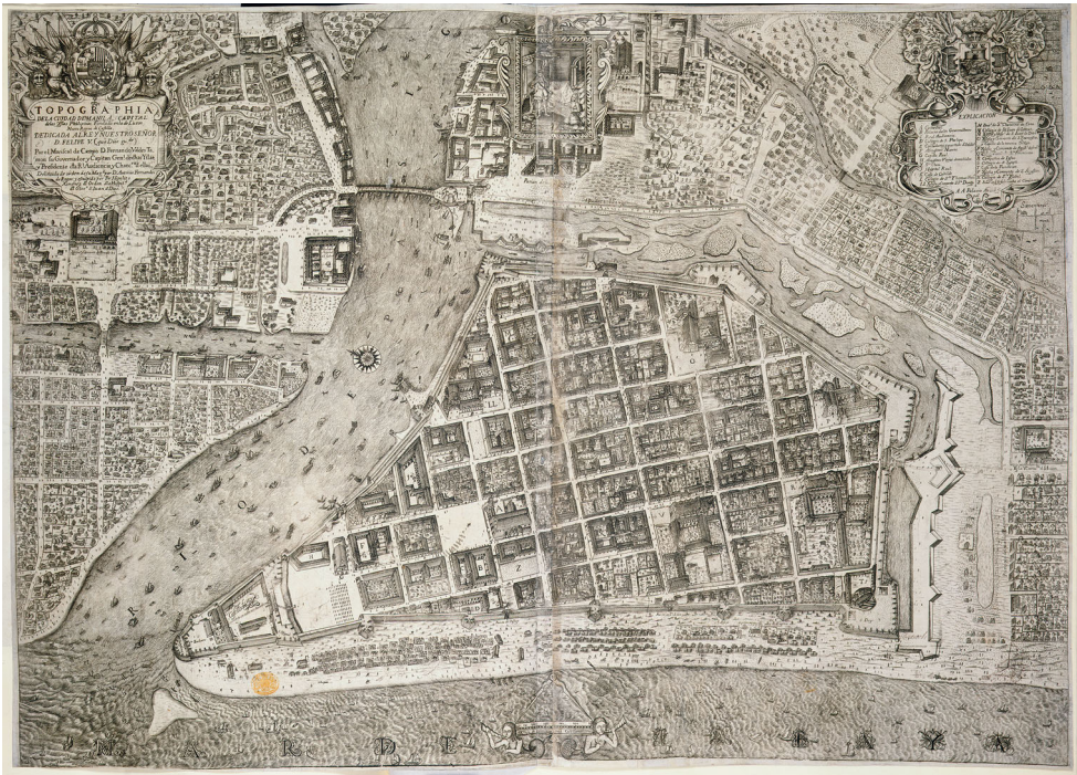
Figure 2. Hipólito Ximénez after Antonio Fernández de Roxas, Topographia de la ciudad de Manila, capital de las yslas Philipinas , ca. 1739. © British Library Board, Maps K.Top.116.40.

in the Gazetteer's entry for Acapulco—from Anson's map. Hence, it asserted that 'at the beginning of the last war [Manila] was only an open place, its principal defence being a small fort.' Further, the Roxas map was lodged in King George III's topographical collection in sequence with the first British-drawn map of the city. And finally, it bears the inscription, in English, of the location of British batteries and the 'Breach' of the city walls at Bagumbayan. This suggests the Roxas topography may have been used by returning officers to present an account of the expedition to officials in London. Indeed, it is not too much of a stretch to imagine this materially enhanced account of British victory in the Pacific being made by Cornish's representative, Richard Kempenfelt, whom Cornish sent 'with my dispatches, and [who] will have the Honour to present to you some Coppar [sic] Plates of the Philippine Islands, that were found in Manila.' 19