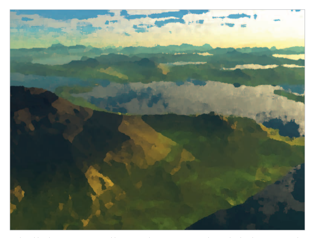
A digital landscape image created by a textural generation system that evolved with computational aesthetic support. (See article in this issue by Prasad Gade et al.)