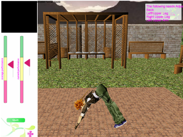
Fig 2. Screenshot of on-screen display during exercise.