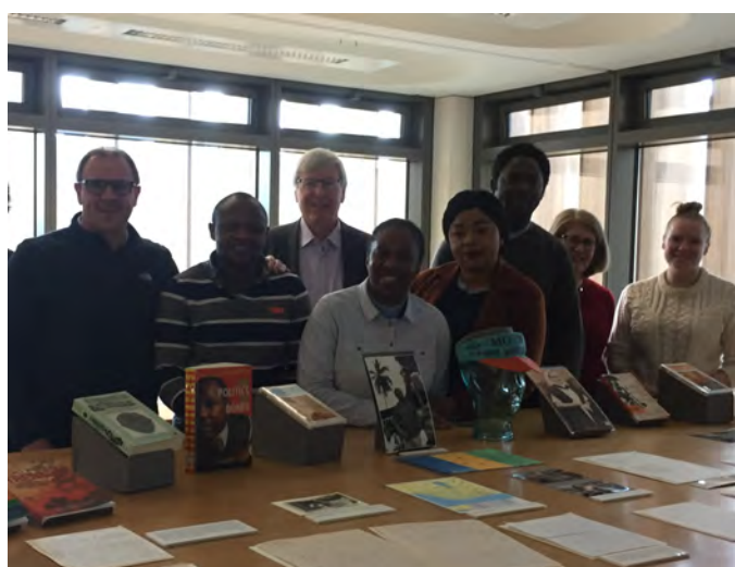
Visitors from the Kennedy Institute

MU approached Special Collections and Archives about the possibility of using the Ken Saro-Wiwa Archive to deliver part of a module entitled Peace, Religion and Diplomacy . The Institute, established in 2011, aims to 'build capacity for constructive approaches to conflict at all levels in society'. Through a series of lectures and workshops, the module addresses freedom of thought, conscience, religion, or belief, and raises questions regarding religion and society from the perspective of diplomacy.