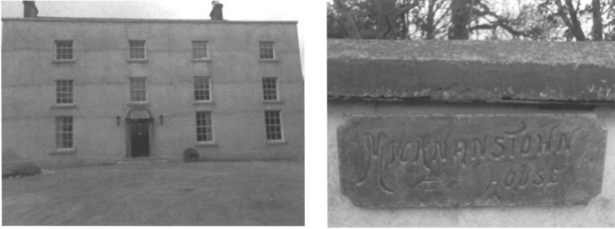
Figures 5 & 6 Micknanstown House, County Meath, & wall plaque 18