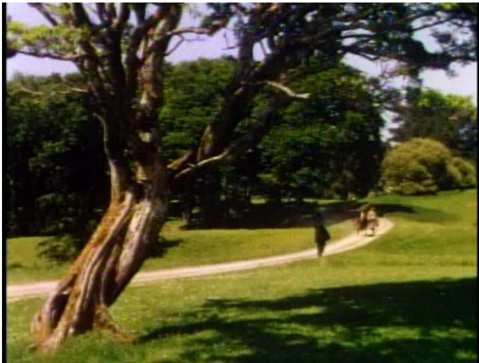
Fig. 3. The Quiet Man (Republic Pictures, 1952)

Sean and Michaelleen continue their sojourn through this exotic landscape until they meet the local priest. The next still depicts the jaunting car approaching the priest. 18 Here, we are provided with the most panoramic view of the landscape in this sequence (Fig. 3):