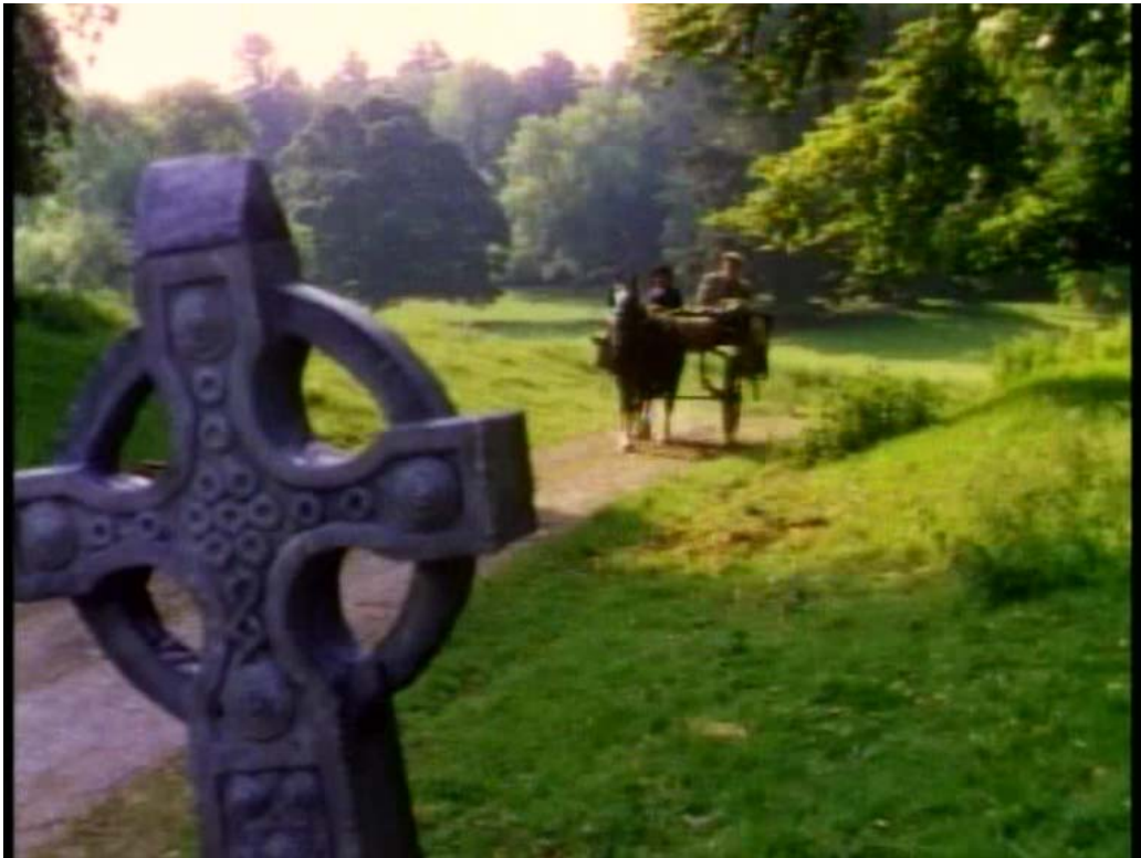
Fig. 2. The Quiet Man (Republic Pictures, 1952)

The following scene has another example of visual extravaganza. As Michaeleen and Sean pass along the now visible road, an old Celtic cross comes into view (Fig. 2):