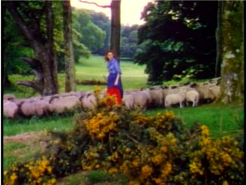
Fig. 2. The Quiet Man (Republic Pictures, 1952)

Gibbons has subtitled this particular shot as ‘paradise regained’ 19 and states the following: