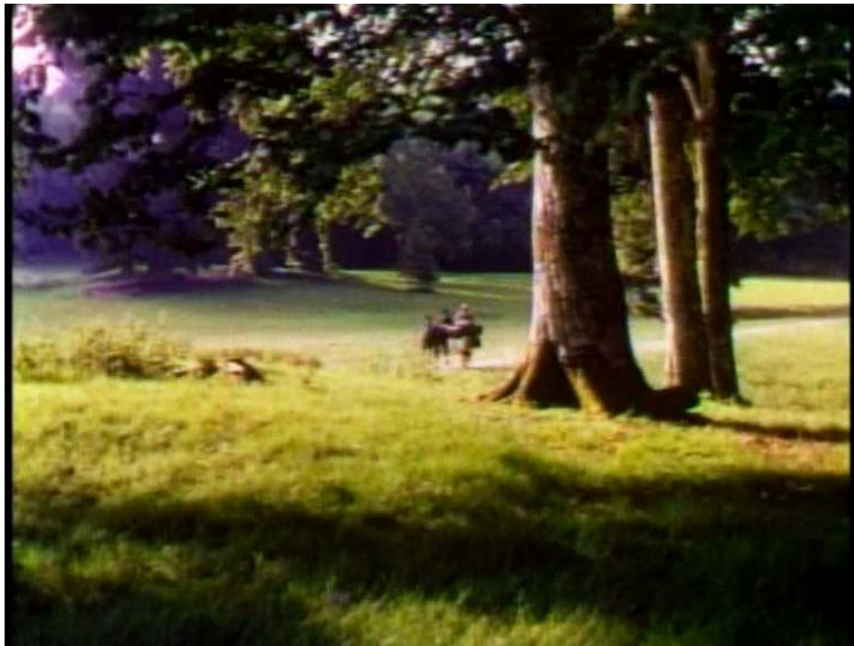
Fig. 1. The Quiet Man (Republic Pictures, 1952)

driving Sean along through the countryside in a jaunting cart as is depicted in the following still (Fig. 1):