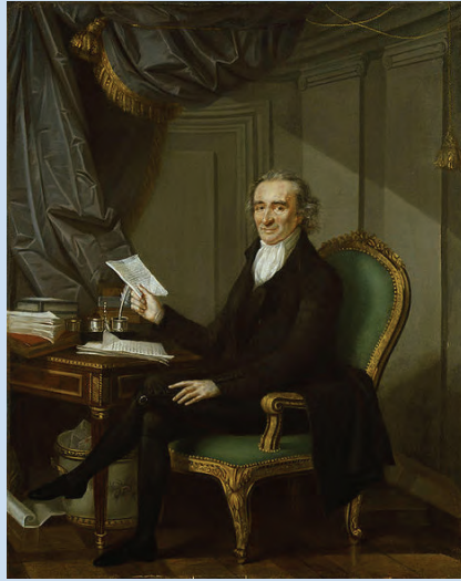
Thomas Paine 1737-1809

After the French Revolution it was also the case that foreign colleges had nearly all been closed, especially those in France, another factor which added to the case for the establishment of the