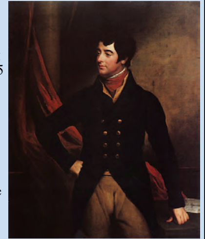
Lord Edward Fitzgerald 1763-1798