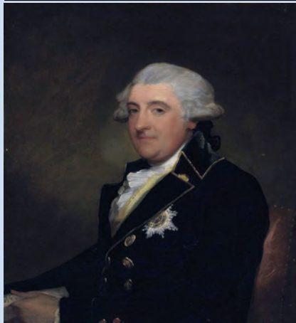
William Robert 2nd Duke of Leinster (1749-1820)