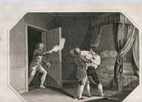
Two men apprehending Lord Edward Fitzgerald at gunpoint.