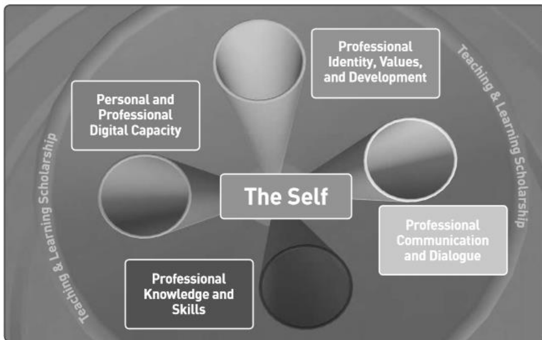
Figure 2: The national professional development framework for all staff who teach in Higher Education

The below graphic illustrates the five domains of for the professional development of teaching staff in HEIs identified by the National Forum.