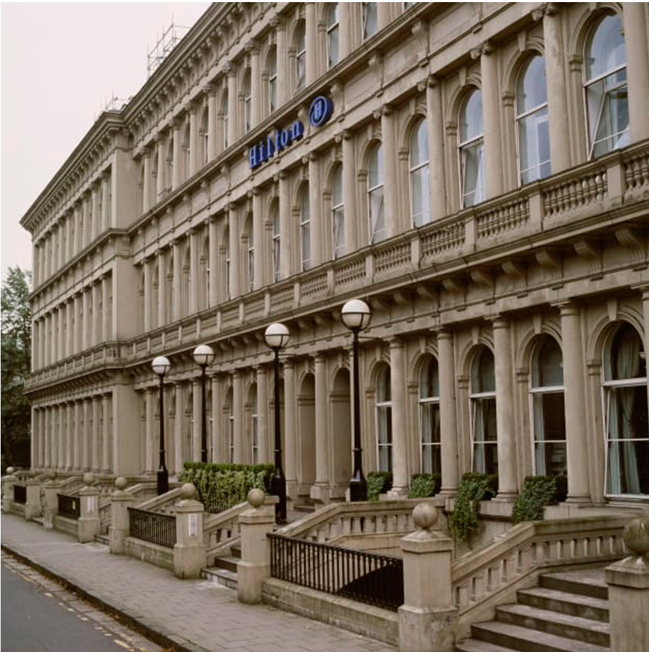
Plate 4. Where Space and Polity was born: The Grosvenor Hotel in the West End of Glasgow.

my remarks about Ronan's complex response to Brexit, but it was beautifully crafted here and also immediately connected to his abiding concern with how 'the territorial basis within which political processes are transacted undergoes continuous change', yielding an ever-cycling 'de- and re-territorialisation of politics' (Paddison, 1997, p. 6). Put another way, and encapsulating the new journal's mission, ' Space and Polity aims to inform the theory and practice of the changing spatialities of politics, power, government and governance' (Paddison, 1997, p. 7).