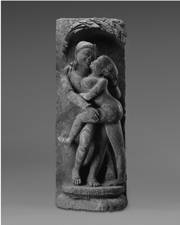
Figure 2. Loving couple (mithuna), Eastern Ganga dynasty, 13th century. New York, Metropolitan Museum of Art. Ferruginous stone, H. 72 in. (182.9 cm). Purchase, Florance Waterbury Bequest, 1970. Acc.n.: 1970.44.

In bharatanatyam , not only does the performer imitate the poses of the characters she invokes, but her gestures are also said to imbue emotional inflection. The devadāsi's mudhras (signifying gestures) are expressive of bhavas (moods) that draw on a long history of associations. The mudhras convey the dancer's experience but are also intended to arouse a specific response, or rasa , meaning "flavor or essence," from spectators. 33 Navarasa theory, as expounded in Bharata-Muni's transcription of the oral tradition in the Natyashastra , serves as a guide for Indian drama