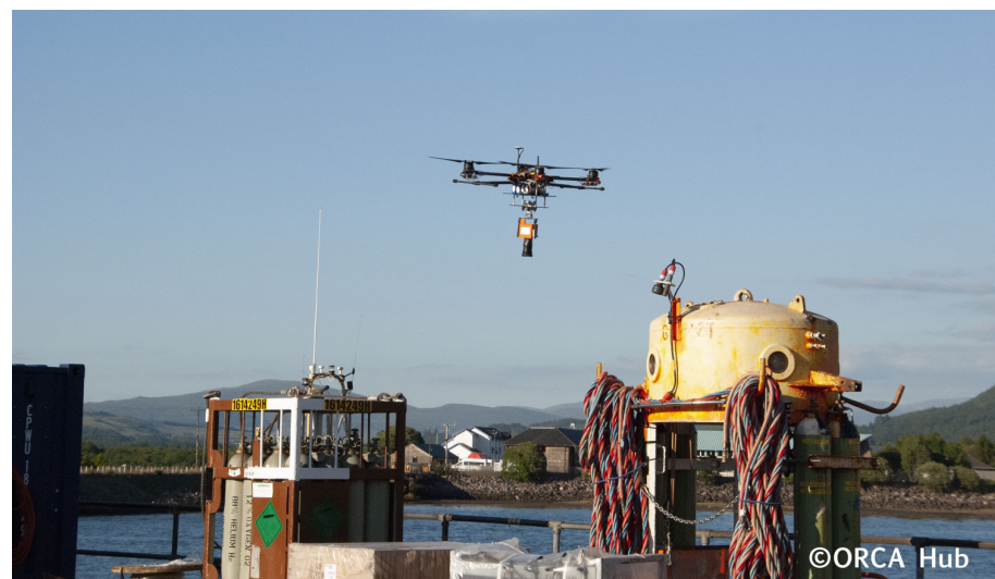
Figure 2. Unmanned aircraft operation near offshore structures.

EXAMPLE: Offshore energy assets, such as wind farms and oil platforms, are dangerous and difficult to access for human workers. Consequently, such activities are also time-consuming and expensive. Unmanned aircraft are increasingly used to perform remote inspection tasks in which different parts of the offshore structure are examined using cameras or touch sensors (see Figure 2).