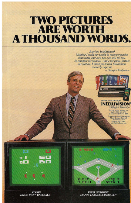
Figure 8 — Mattel Electronics Intellivision flyer comparing Atari’s Home Run (L) with Intellivision’s Major League Baseball (R).

game industry went from a $3.2 billion business in 1983 to $100 million in 1985. 87 The European market was also heavily affected and sales fell significantly. 88