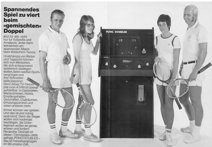
Figure 5 — Pong Doubles flyer.

With the help of these games, Atari established itself as a leader in the rising video game industry, and a game development pioneer. 54 Starting in 1972, major American pinball and amusement machine manufacturers began to produce Pong clones, including Nutting Associates' Computer Space Ball (1972) and Wimbledon (1973); For-Play's Sports Center (1973); Amutronics' TV Hockey (1973)