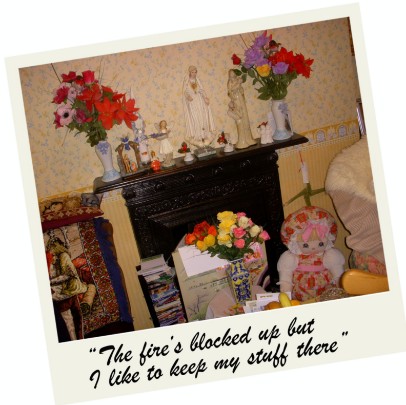
Fig.2: A Female Research Participant's use of her Redundant Fireplace as a Gathering point for her Important and Sentimental Artefacts.