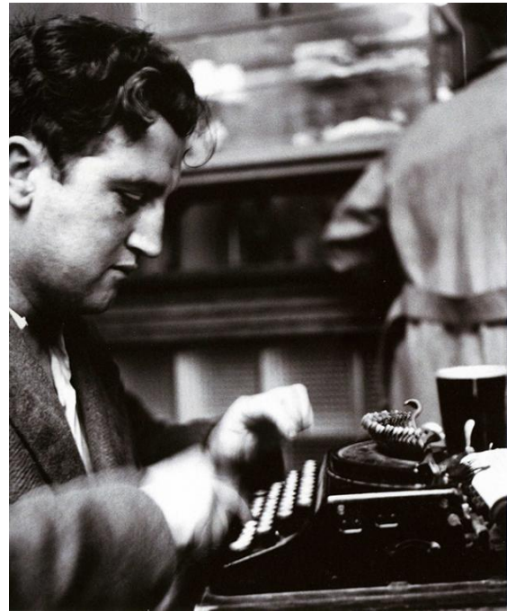
Playwright Brendan Behan

members of An Club Dramaíochta, guestlists, and notes.