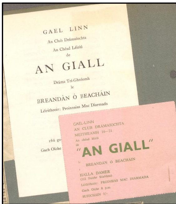
Programme and ticket for An Giall, 1958 (Maynooth University Library)