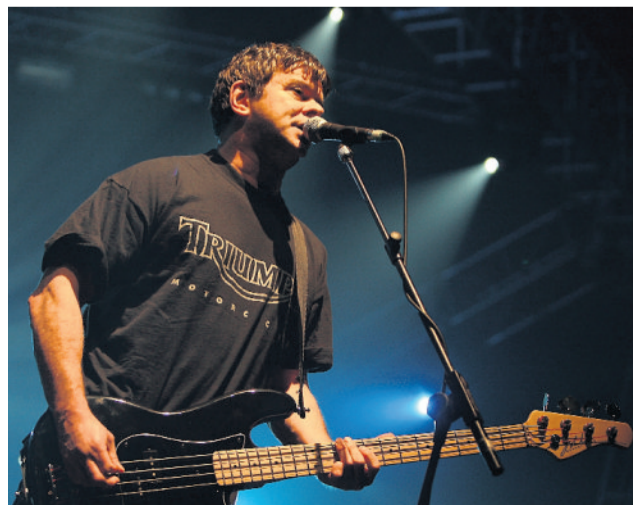
- E GRADE Punk philosophy: Jean-Jacques Burnel of The Stranglers

And my commandment reads: Educate people for jobs this time round, not for the education industry.