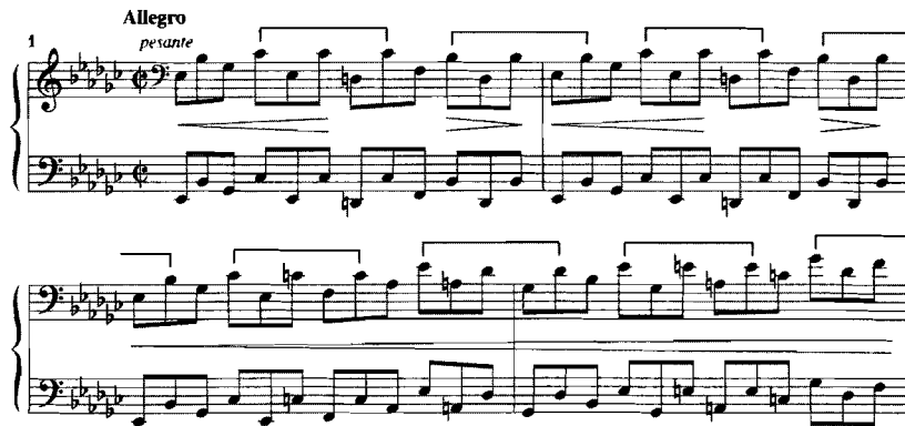
Example 4. Prelude, Op. 28 No. 14, bars 1–4, with grouping annotations. 2

The top voice highlights \hat{s} ( B\flat ) with neighbour motion from C\flat . It then moves C\flat-C\sharp E\flat-D\flat , and, in sequence, E\flat-E\sharp G\flat-F . Looking at the rhythmic reduction, it can be seen that increased movement is caused by the change in the LIPs. Chromatic inflection in the first half of the bar results in a triplet effect, and a reaching-over of the seventh continues this in the second half of the bar, as both the fifth and seventh resolve to the sixth. Here we see an example of the co-dependency of the tonal and the rhythmic organisation in this piece. This increase in tonal and rhythmic movement shifts the harmony into the dominant minor, B\flat . A repeat of the opening begins in bar 5, with emphasis on \hat{s} ( F ) with its upper-neighbour in the dominant minor key.