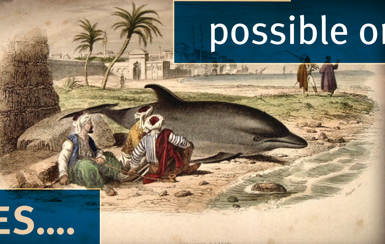
LE DAUPHIN VULGAIRE