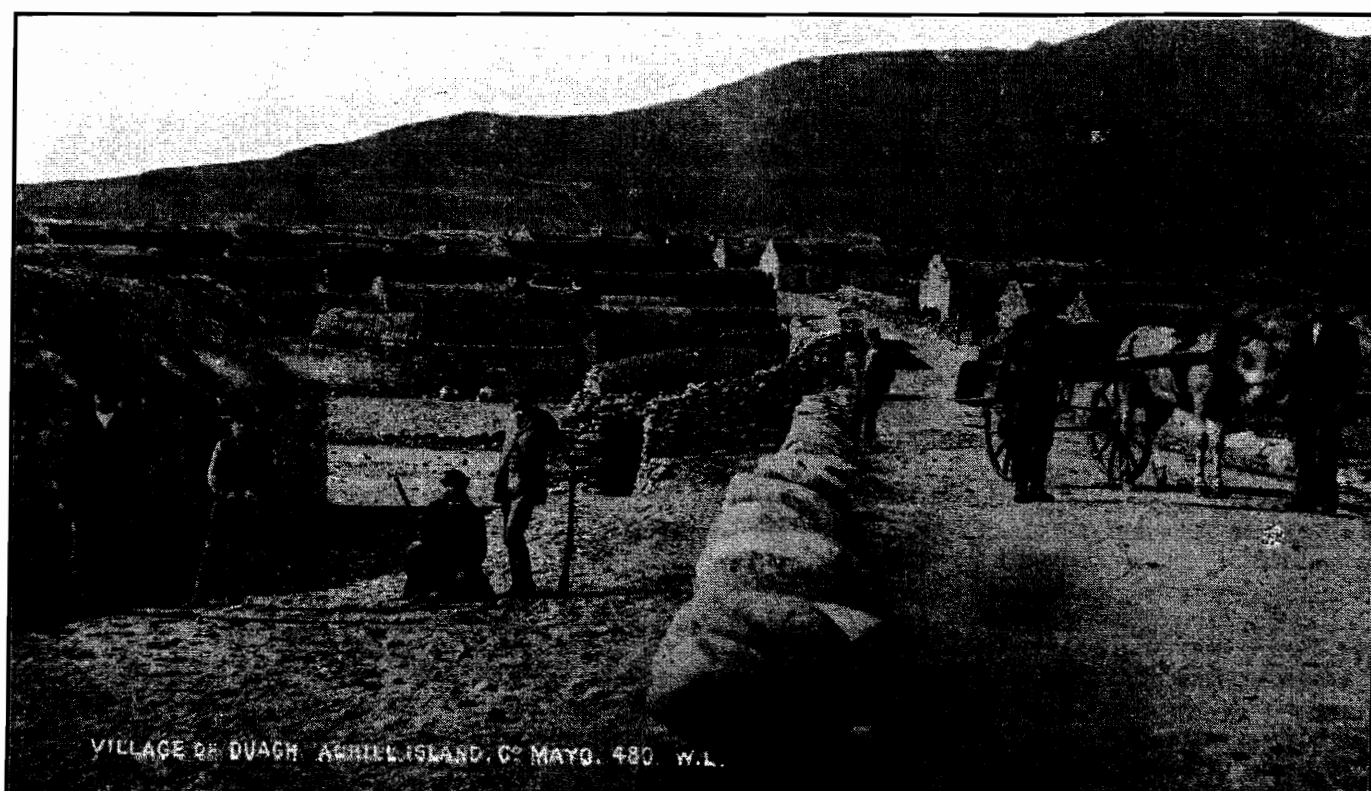
Village of Duagh (sic), Achill Island, Co. Mayo (circa 1880-1912)

To date, the most prolific debates on the rundale system have concerned theories of its origins, most often expressed as a conflict between, on the one hand, documentary and archaeological evidence and, on the other, supposedly epistemologically inferior ethnological work. The nature of this debate has hinged on the widely-contested notion of the antiquity of the rundale system, and its concomitant pattern of nucleated settlement. Institutional Irish scholarship on the rundale system and clachan finds its roots in the Queen's school of Historical Geography; most notably the contentions