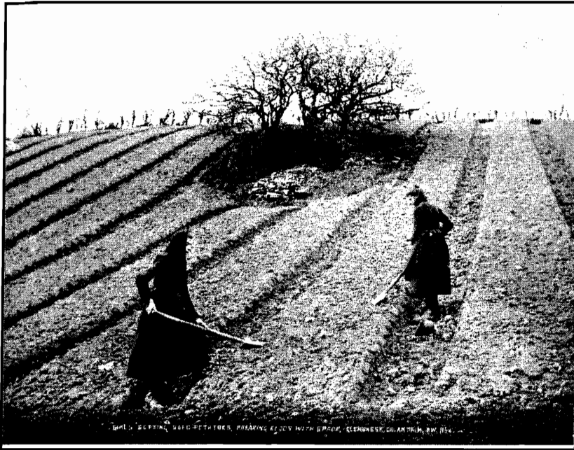
Girls Setting Seed Potatoes, Breaking Clods with Spade, Glenshesk, Co. Antrim

property. The next reference to the rundale comes from Engels's The Origin of the Family Private Property and the State (1884), which was based on Marx's comment in the Ethnological Notebooks . As the reader can see, it displays a deep understanding of the rundale system: