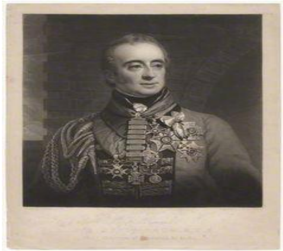
3. Irish Waterloo generals (i): Major General Sir Denis Pack.