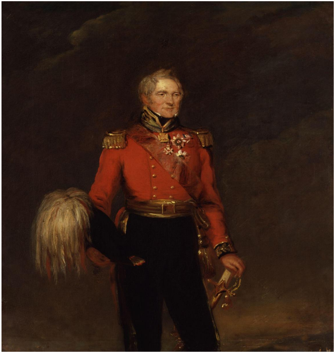
5. Irish Waterloo generals (iii): Major General Sir John Ormsby Vandeleur.

Source: 'Napoleon Series' ( http://www.napoleon-series.org/cgi-bin/forum/webbbs_config.pl?md=read%3Bid=128909 )