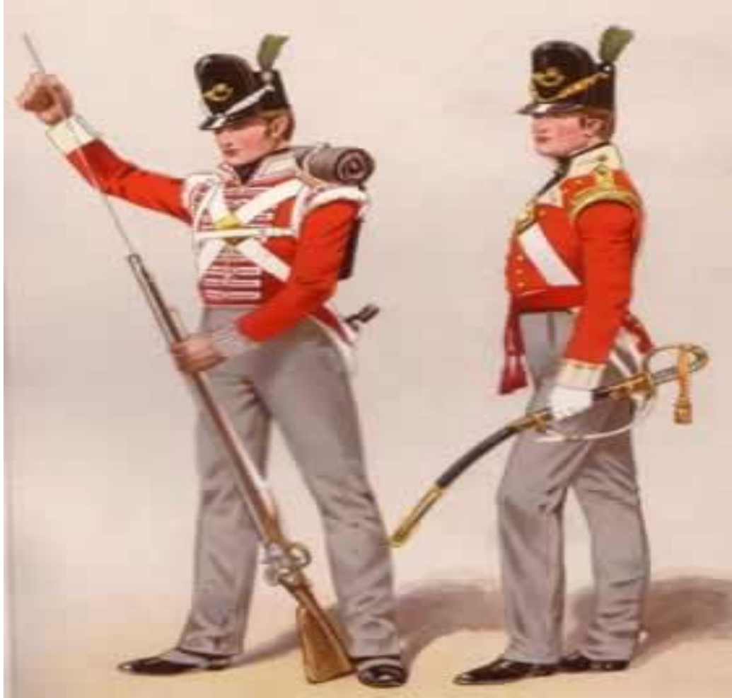
2. Irish soldiers of the British army: private and officer, light company, 27 th (Inniskilling) Foot, c. 1812-16. The infantry uniform depicted is that worn during the Waterloo campaign.