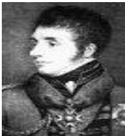
4. Irish Waterloo generals (ii): Major General Sir William Ponsonby.

( http://www.npg.org.uk/collections/search/portrait/mw38039/Sir-Denis-Pack ).