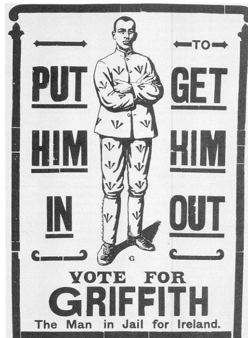
Fig I: Sinn Féin 1918 election poster

him in to get him out, Vote for Griffith: the man in jail for Ireland.’ 15 This poster was typical of the sort of propaganda that Sinn Féin dispersed nationwide.