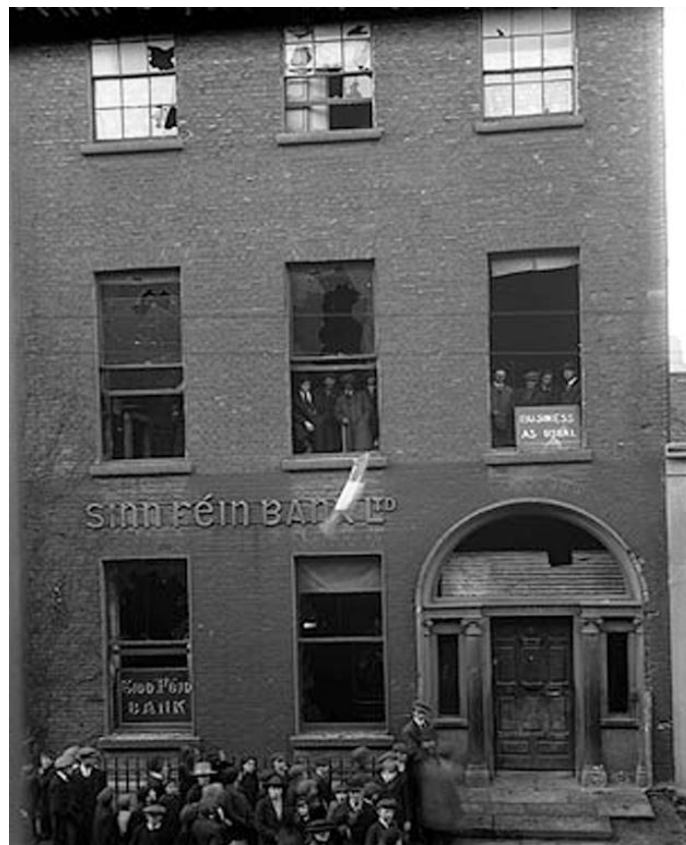
Fig VI: The Sinn Féin Bank, 6 Harcourt Street, after a raid

being passed from hand to hand all over Ireland'. 55 By suppressing the freedom of the press, the government had given the loan the best advertisement possible. Also, men and women who may have been apathetic towards Sinn Féin would have been irritated by being unable to purchase their regular provincial newspaper. Cooper had first-hand experience of the situation in Ireland and he was of the belief that the outright suppression of the Dáil, and all of its programmes and institutions, was the wrong course of action to take. A policy of suppression would only be beneficial for the loan campaign, and the pursuance of such a policy was probably welcomed by Michael Collins and his colleagues. Doubtless however, the British administration felt that the suppression was entirely justified given the escalating violence in Ireland and the links between Dáil Éireann and militant republicanism.