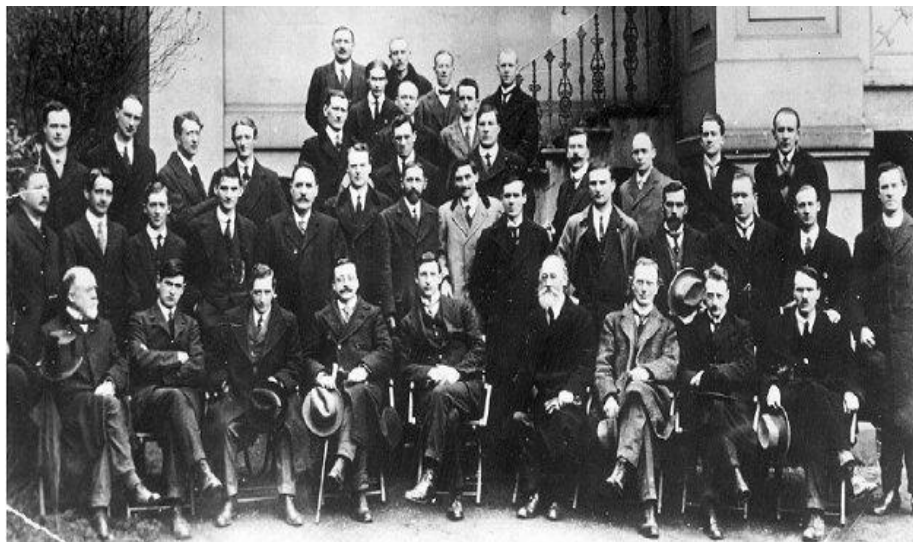
Fig II: Members of the first Dáil Éireann