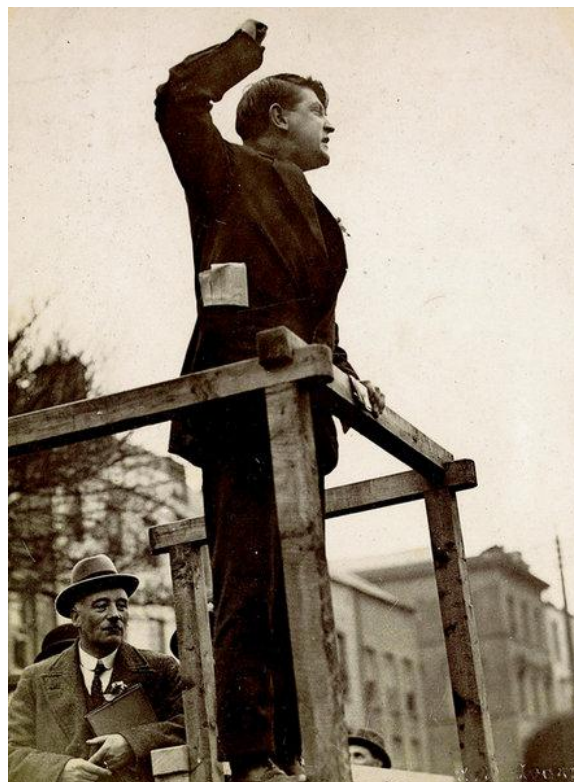
Fig III: Michael Collins addressing a public meeting