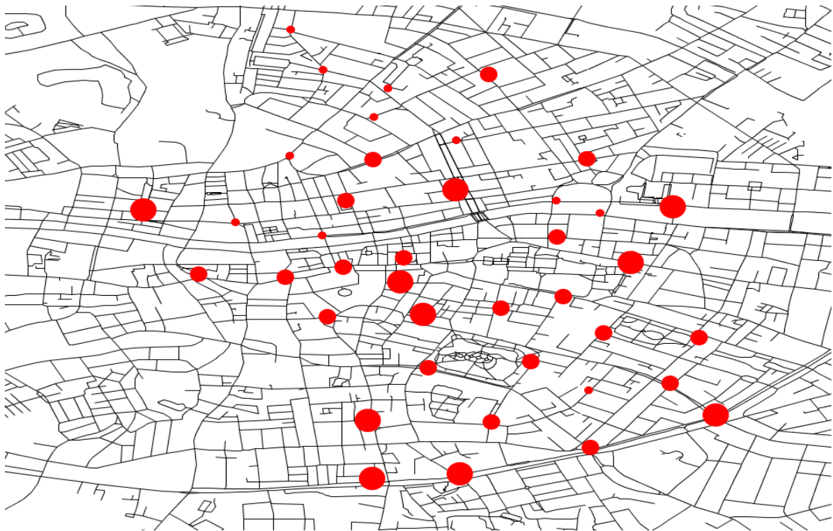
Figure 2. Location of all 40 DB terminals. Larger circles indicate busier DB terminals. OpenStreetMap for Dublin is used as the base map

Figure 1 shows a frequency distribution of the mean number of checkouts per day for all DB terminals over the entire observation period. Three clusters of stations are immediately apparent – stations with a daily checkout mean of less than 25, stations with mean daily checkouts of between 25 and 45, and finally stations with mean daily checkouts of between 45 and 60 checkouts.