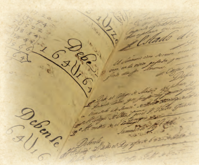
Account book of the Irish College, Salamanca 1772

In the archive one can find material as varied as: students' oaths, rectors' private papers, administrative & private accounts, leases of property owned by the Irish colleges, rents & royalties, mortgages, title deeds, receipts, books of income & daily expenses, correspondence, petitions, royal bulls & briefs, proclamations & decrees, execution of wills, annuities and college photographs.