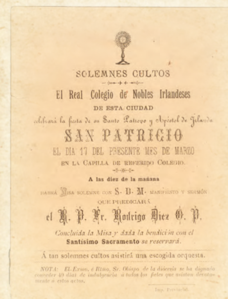
Invitation to celebrate mass St Patrick's day in the chapel of Irish College, Salamanca 1919