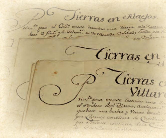
Copy of lease of lands, demarcating the fincas owned by the Irish College, Salamanca 1757