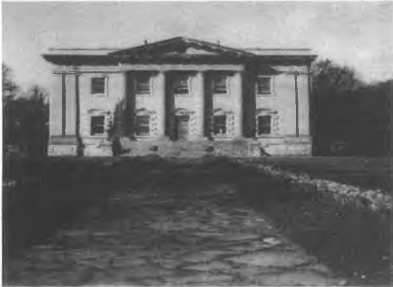
Kilboy in 1939.

Kilboy House was reinstated but the new house was not an exact replica of the old one, it was rebuilt minus the attic story and the basement was blocked up in order to make the house more manageable. There were changes to the shutters, the room sizes, and the dado rails and decisions pondered upon as whether to paper or distemper the walls. Lord and Lady Dunalley determined to make Kilboy their home once more returned to Tipperary in 1927. Ireland was now the Free State.