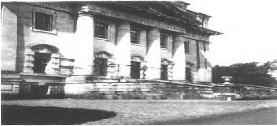
The imposing steps of Kilboy House

miraculously missed these two unarmed and absolutely harmless elderly people and in consequence of these attacks they were driven from Kilboy House and forced to flee from Tipperary and Ireland into exile. 125