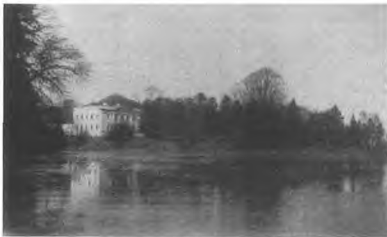
Kilboy, a handsome home in the trees.

Finally, in this study I have attempted to open a window on an era of immense change of past politics and events to gain an insight on peoples thoughts and feelings prior to and after the burning of Kilboy House in Tipperary. Today, big houses are seen as part of Ireland's cultural heritage the 'Irish big house' is increasingly valued for its architectural significance; for the wealth of design created for the most part by Irish craftspeople; and for the valuable insight it offers us into an era that had such an influence on shaping our history'. 296 The burning of Kilboy House in Tipperary although significant for the Prittie family and the people in the area was only one incident among many that occurred during a time of enormous radical upheaval in Ireland.