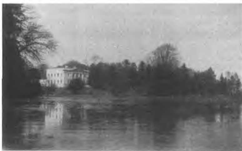
Kilboy, a handsome home in the trees.