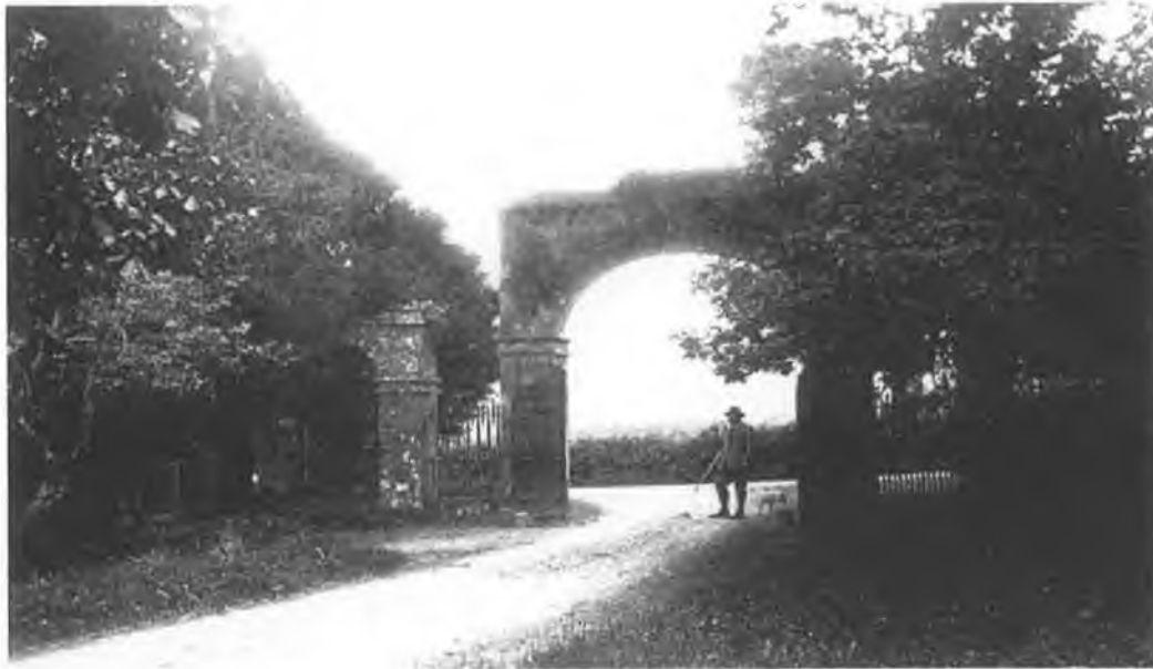
The Buck Gate

The years 1780-1840 were a great period of demesne development in Tipperary and the embellishments and ornamentation of the precincts of the big house created a contrived landscape, which highlighted place and identified the refinement of the proprietor. Landlords such as Henry Prittie were established travellers and brought back collections of unusual plants and paintings and other collectables to display in their demesnes. 7 Most of the big houses belonged to the classic Irish house of the middle size as defined by Craig who noted that Tipperary was one of the nine counties in Ireland with the highest density of such houses. 8 Kilboy House is also noted on a list of protected structures in the townland of Kilboy. 9