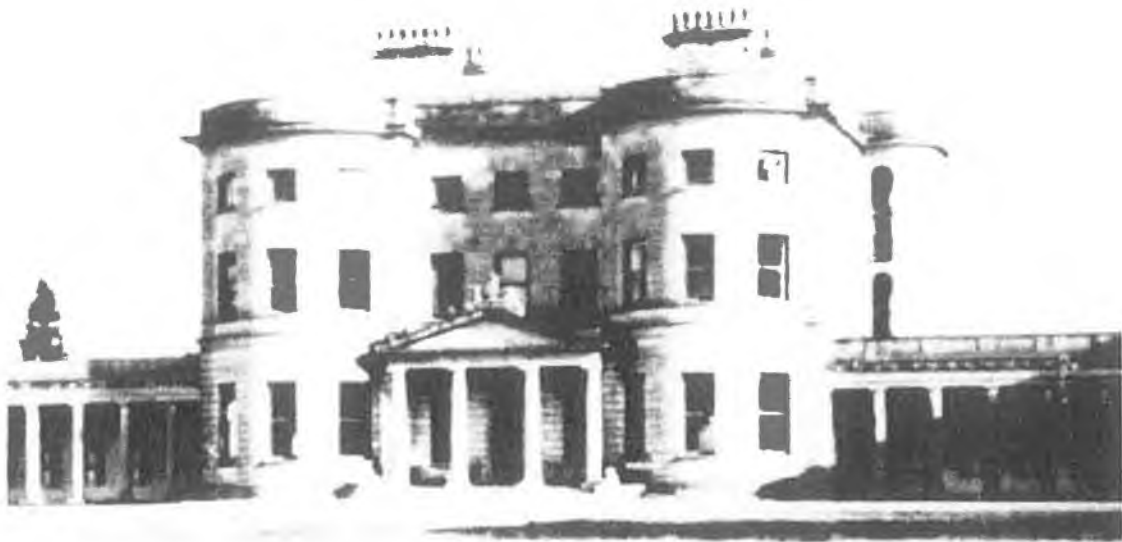
Lyons House, Co. Kildare.