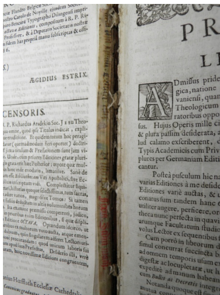
Manuscript fragment in printed book from the Furlong collection

The collection includes many continental imprints and nearly 100 Irish imprints. Several of the books are first editions of sixteenth and seventeenth century works. The earliest item in the collection is dated 1540 ( Concordantiae maiores sacrae Bibliae: summis uigilijs iam denuo ultra omnes editiones castigatae ). Many items have ornate bindings and most feature the bookplate of the “House of Missions Enniscorthy”.