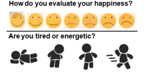
Figure 3: Image scales used to evaluate happiness [27] and fatigue.

While the fatigue average image chosen in the beginning was the second from left, at the end it was the third. Happiness was initially situated at the third smile, at the end of the test it would be at the second face.