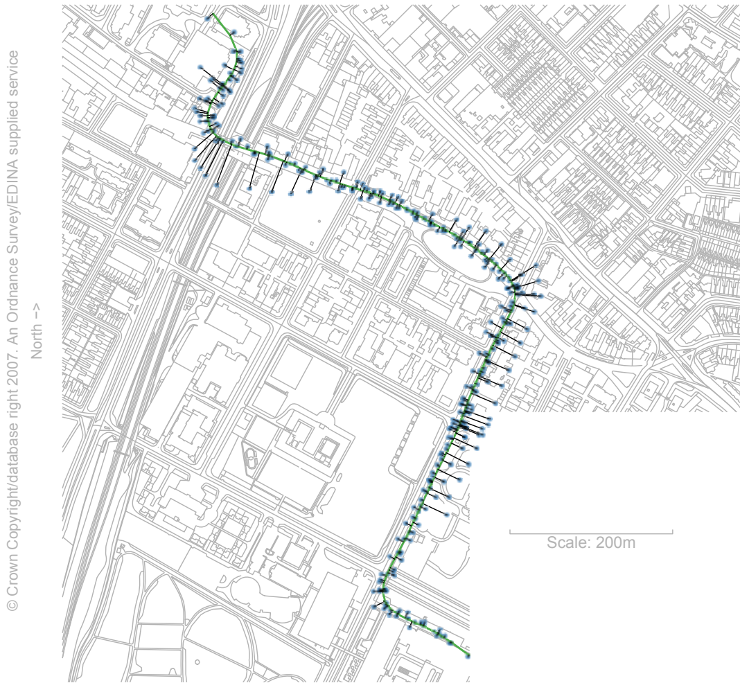
Figure 3: Robust principal curve (green) fitted to GPS point cloud data.