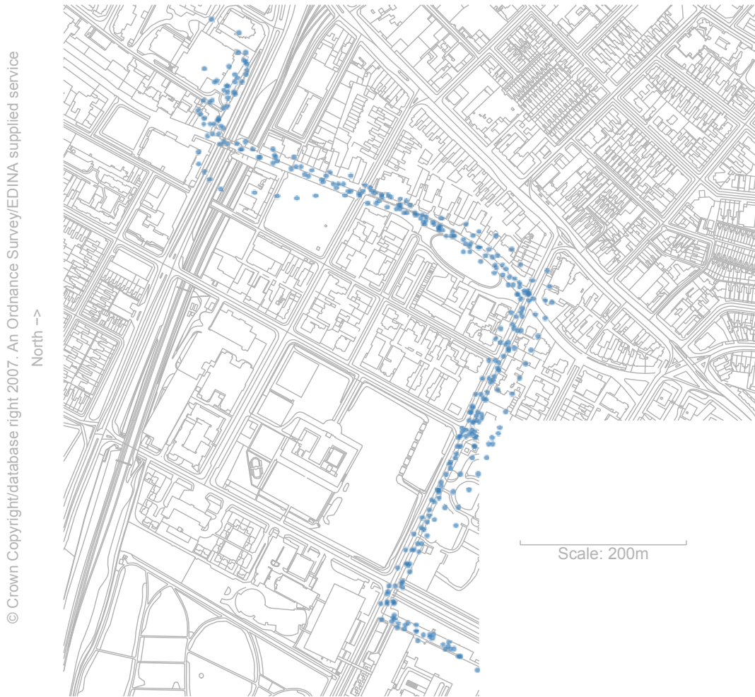
Figure 1: A point cloud showing recorded GPS tracks in Leicester.