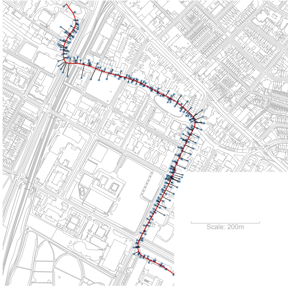
Figure 2: Principal curve (red) fitted to GPS point cloud data.