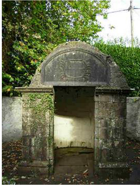
Fig. 5 Covered Water Source, Castleconnell Spa, Co. Limerick.