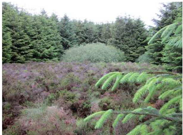
Fig. 2 Site of Lough Leighis (Loughanleagh), County Cavan

A persistent associated theme in discussions of medical regulation and power was that of training and healing expertise. In the development of a hierarchical structure of formal medical power, training was crucial. Metaphors exist of the folk practitioner as representing the ignorant/untrained/low/unapproved and the medic as representing the knowledgeable/trained/high/approved (Logan 1981; Moore and McClean 2010). Such words recur over and over in discussions, evidence of a notional ‘drawbridging’ of ownership and status. The relationship between training and regulation can even be seen in contemporary attempts by CAM practitioners to be accepted by formal medicine through strict training requirements (Clarke et al. 2004). Critical questions do need to be asked about the regulation of informal folk medicine as accusations of quackery were often apposite (Porter 1989). Quackery did result in some genuinely dangerous historic practices, the response to which in turn became a central plank