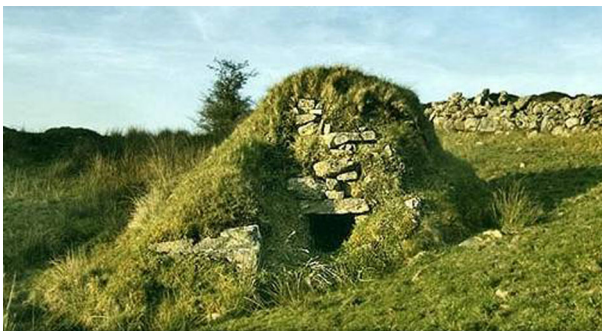
Fig. 1 Sweat House. Legeelan, County Cavan

While one of the concerns of formal medicine was the lack of regulation they associated with folk medicine, there was evidence of some good regulatory practice at sweat houses (Hufford 1998). Used to cure flu, arthritis and rheumatism, they were sometimes regulated by itinerant bath masters who would check potential users as to their ability to withstand the rigours of the sweating cure (Richardson 1939). More importantly, sweat houses were privately or communally owned, providing a service to extended families and small