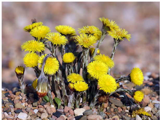
Fig. 4 Coltsfoot

In considering a demand for folk medicine, Cox’s (2010) description of the medical marketplace in Ireland from 1750 to 1950 demonstrated the existence of a hybrid setting where folk and scientific cures were equally used, a forerunner perhaps of the online medical marketplaces of the early 21st century. Herbal medicines were central to folk-medicine and drew from pharmacopeias of considerable range. The violet was used in Ulster as a cure for cancer by dint of stewing and drinking of the liquid and the same applied to coltsfoot (Fig. 4) as a cure for asthma and lung disorders (Ballard 2008). This simple form of extracting concentrated therapeutic materials from original herbal form would not be unfamiliar to a modern pharmacist. Poultices, evident in forms such as eel-skin bandages from Lough Neagh, have parallels in many cultures (Ballard 2008). In such rural settings, the relationships between