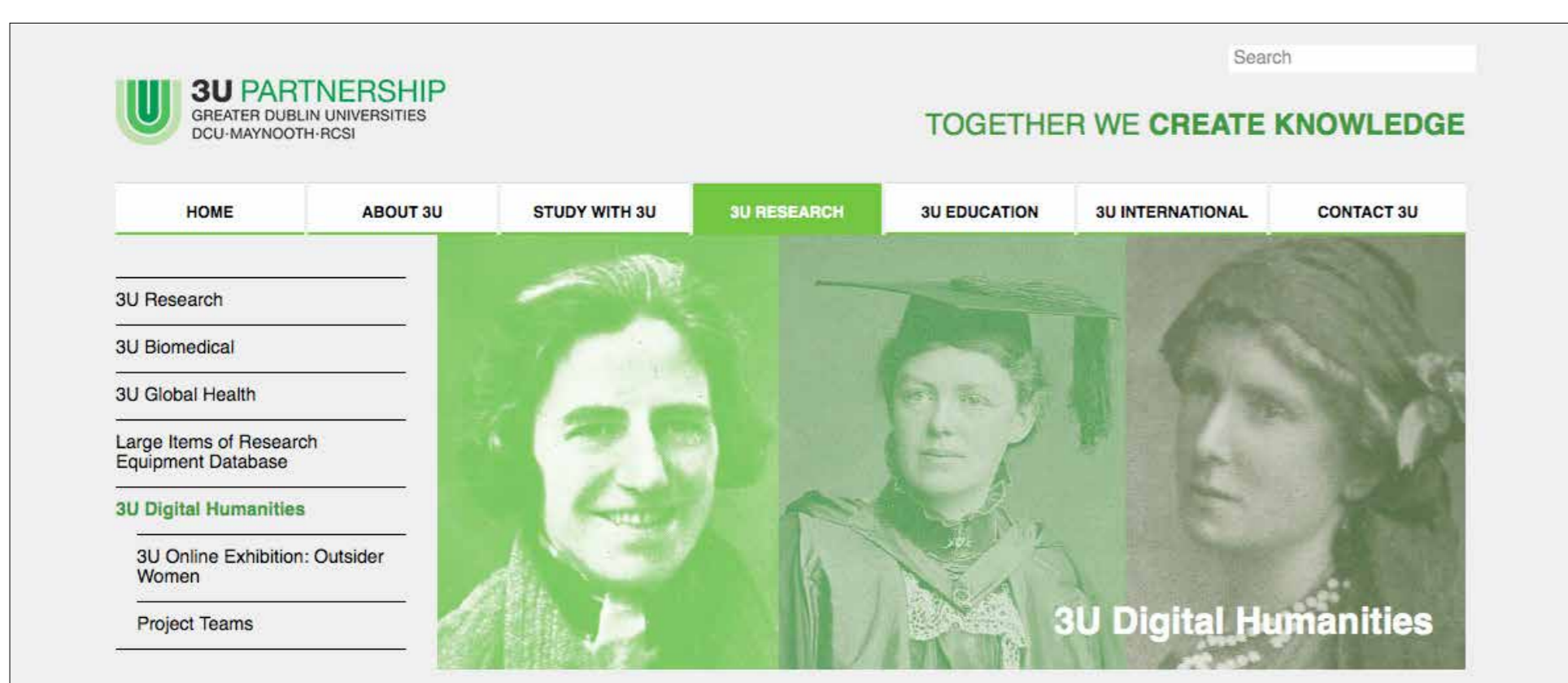
Portal Site: http://3u.ie/3u-research/3u-digital-humanities/