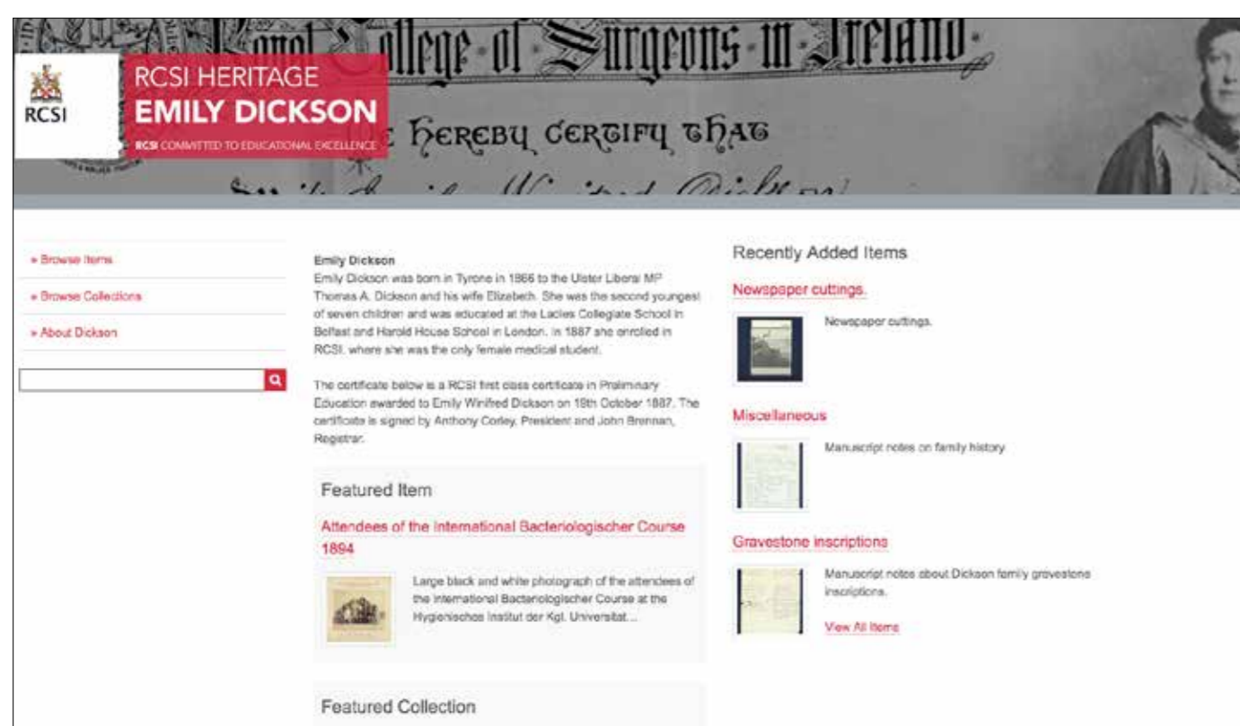
Emily Winifred Dickson http://dickson.rcsi.ie/