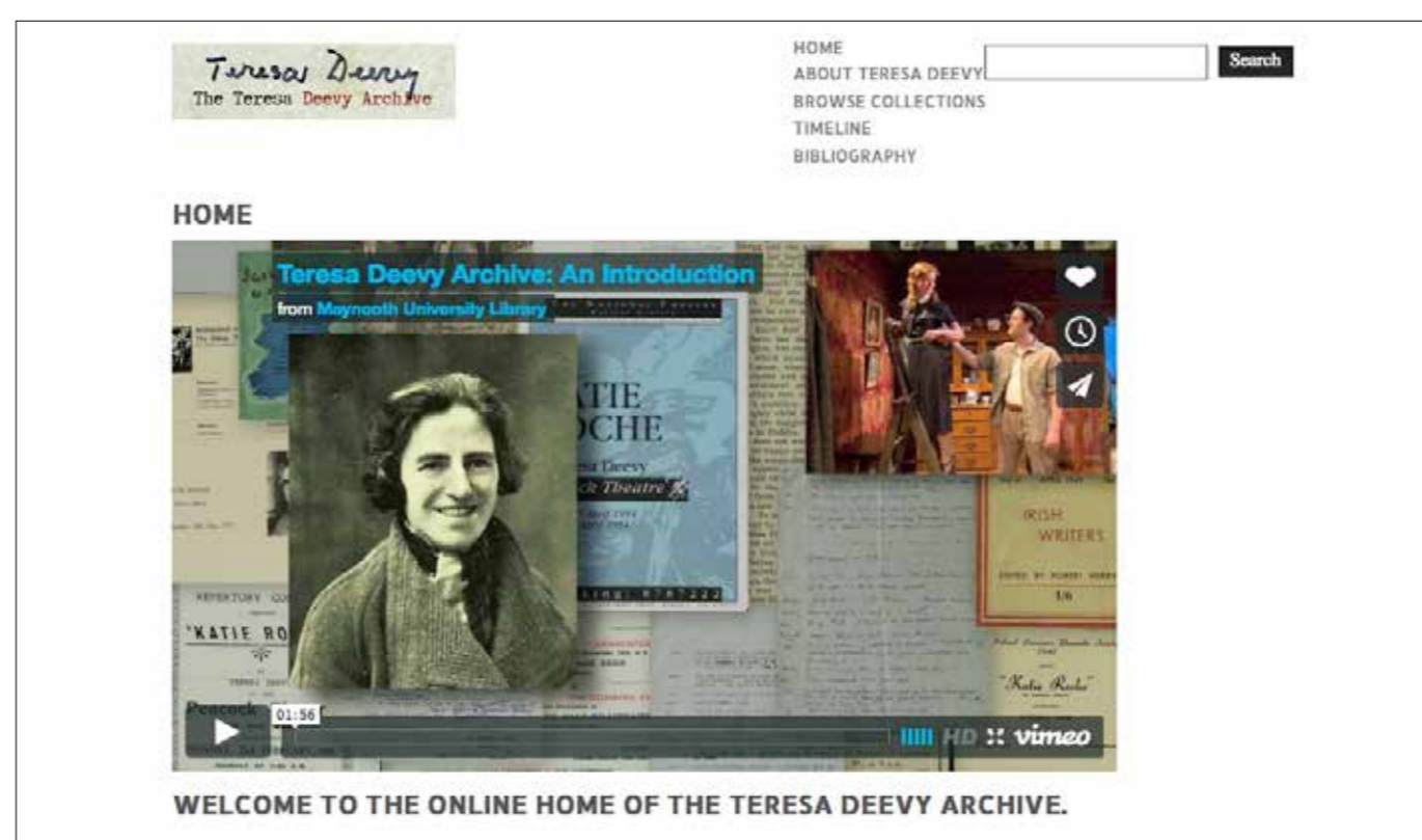
Teresa Deevy http://deevy.nuim.ie/