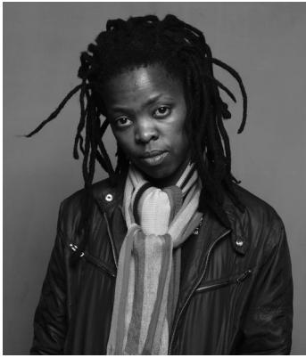
Zanele Muholi 13 Oct. 2012 in Firenze, Italy