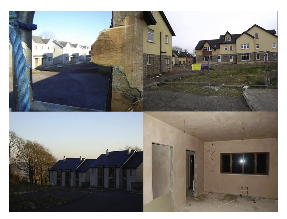
Fig. 1. Examples of 'ghost estates'.

While the property market was still booming unfinished construction sites were comprehensible within the dominant Celtic Tiger narrative as developments that were yet to be completed and occupied. For most people, they did not constitute a worrying sight,