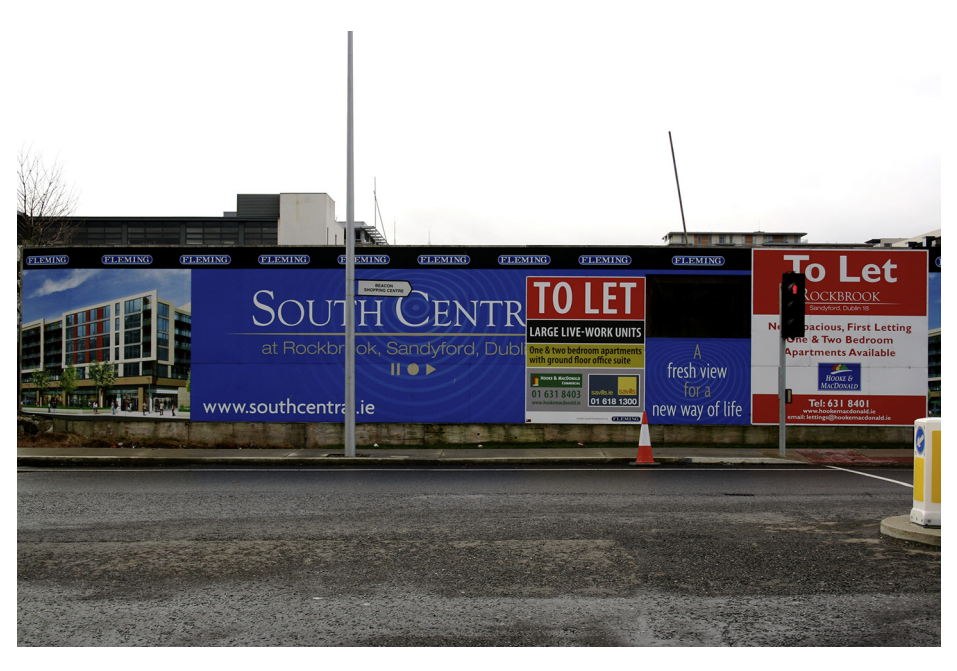
Fig. 3. A fresh view of life: Hoardings around unfinished developments, Sandyford, Dublin 2009.

'A fresh view for a new way of life'... The jaunty advertising slogan of this particular development company has an unintentionally ironic tone: the fact is, for a considerable number of people around the country, living alongside unfinished developments has indeed become a new way of life... One completed apartment block overlooks the shell of another, which has an immense trompe loeil-type piece of fabric covering two sides of it, giving the illusion from a distance that the place is populated with couples on balconies taking in the view, or sitting outside for a bit of al fresco dining (Boland, 2009)