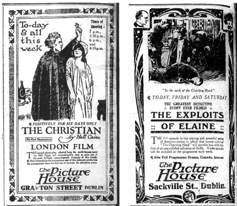
Figure 2 Provincial Cinematograph Theatres' publicity was distinguished by such striking illustrated advertisements as those for The Christian's run at the Grafton in March 1916 and for an episode of the popular serial The Exploits of Elaine at the Sackville in 1915.

exhibitors. The Christian followed the release pattern whereby films that had had a successful first run at the Grafton reappeared shortly afterwards for a second run at the Sackville.